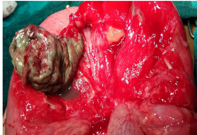
Fig. 2. Axial twisting of diverticulum with a fibrous band attached to the fundus and ileum leading to gangrenous diverticulum.

Exploratory laparotomy revealed axial twisting of diverticulum about 10 x 5 cm arising from anti-mesenteric border around 50 cm proximal to ileo-caecal junction with a fibrous band attached to the fundus and ileum leading to gangrenous diverticulum with clumping of bowel loops along with omental covering (Fig. 2). De-twisting and adhesiolysis along with excision of the Meckel's Diverticulum was done with two layered closure of the defect.