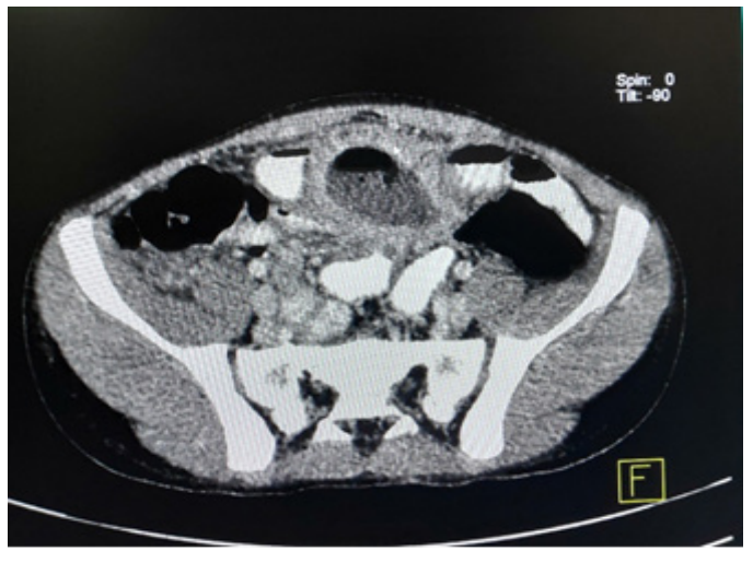
Fig. 1. Showing blind ended gas-filled structure at hypogastrium with thickened enhancing irregular wall associated with adjacent mesenteric fat plane stranding and prominent adjacent vessels suggesting inflammatory lesion.

On per abdominal examination, mild tenderness could be elicited at suprapubic area. A mass about 5 x 3 cm was appreciated at suprapubic region. Tenderness was present, however rebound tenderness was absent. Ultrasonography (USG) revealed an avascular structure in central area with clumping of bowel and omentum over the lesion. Contrast enhanced computed tomography (CECT) revealed blind ended gas filled structure at hypogastrium with thickened enhancing irregular wall associated with adjacent mesenteric fat plane stranding and prominent adjacent axial vessels supplying inflammatory lesion (Fig. 1).