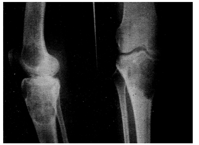
Fig 1: Preoperative radiographs of right knee showing extensive lytic lesion of proximal tibia. Note the "soap-bubble" appearance characteristoc of giant cell tumour.

On the first post-operative day, localized blistering of skin was noticed over the cement implanted area. Patient was able to ambulate painfree, following the procedure. The skin blister was treated by local dressing change. It evolved to form an eschar at two weeks, the operative incision site healed without complications. On repeated dressings, there was no improvement, and no spontaneous epithelisation of the eschar area was noted. The patient on psychiatric follow up was seen to have improved with the prescribed medication. The HAM-D score was 10 at four weeks follow-up. Anti-depressant medication was continued at the