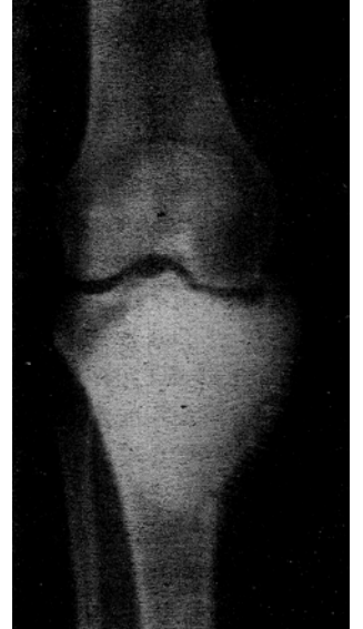
Fig 2: Postoperative Antero-posterior radiograph of right knee showing good articular and medial pillar stability provided by bone cement.