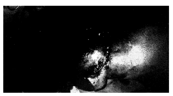
Fig 4: Intraoperative photograph showing medial gastrocnemius rotation flap covering the soft tissue defect.