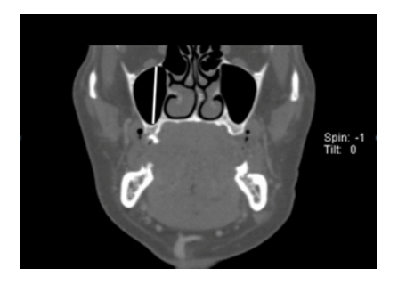
Fig.2: vertical line denotes the height of maxillary sinus.