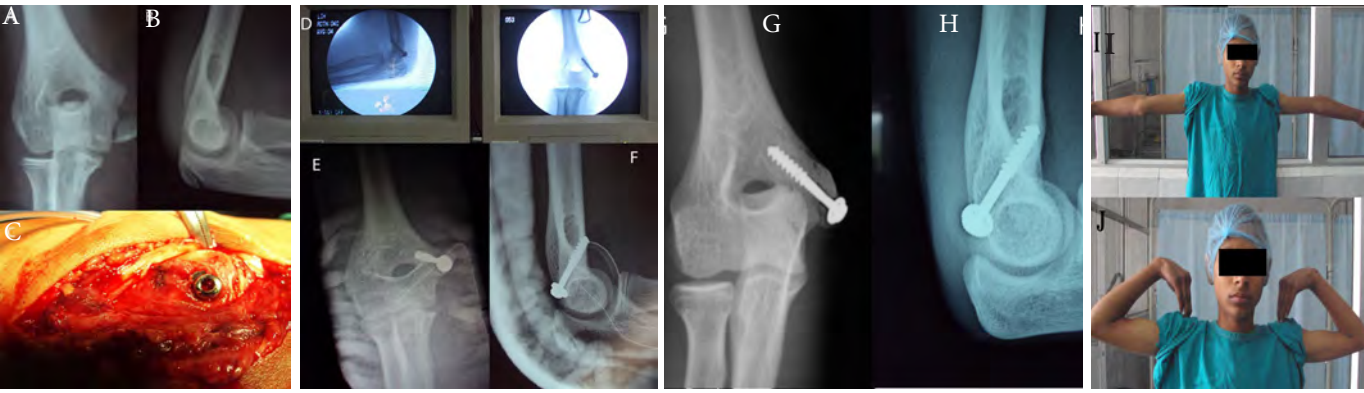
Fig 2: A,B . Antero-posterior and lateral X ray showing (patient 3) medial epicondylar fracture; C. Intraoperative picture showing a screw fixation following valgus stress test uncovering a postero-lateral dislocation of the elbow; D. Peroperative fluoroscopic images with anatomic reduction and fixation with screw. E,F. Immediate postopreative X-rays. G,H. 9 months follow up radiographs showing bony healing of avulsed medial epicondylar fragment; I,J. No deformity appeared in the elbow region at the final follow up, while full movement of the elbow was restored completely.