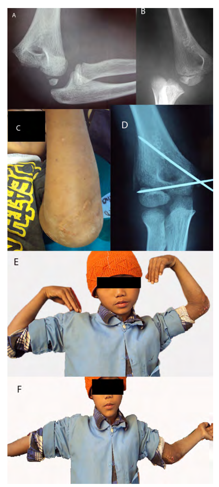
Fig 1: A,B. Representative pre-reduction radiographs (patient 1) showing a displaced medial epicondyle fracture in association with a posterolateral elbow dislocation; C. Injured elbow; D. 2 months postoperative radiographs showing fracture by 2 k wires. Note mild lateral heterotrophic ossification; Clinical picture showing 95° flexion and extension lag of 40°.

and remaining 15 elbows were reduced either in Emergency Department or in operating room. The dominant elbow was injured in 14(70%) patients. The injuries were categorized in: six type II, nine type III, two type IV and three type V.