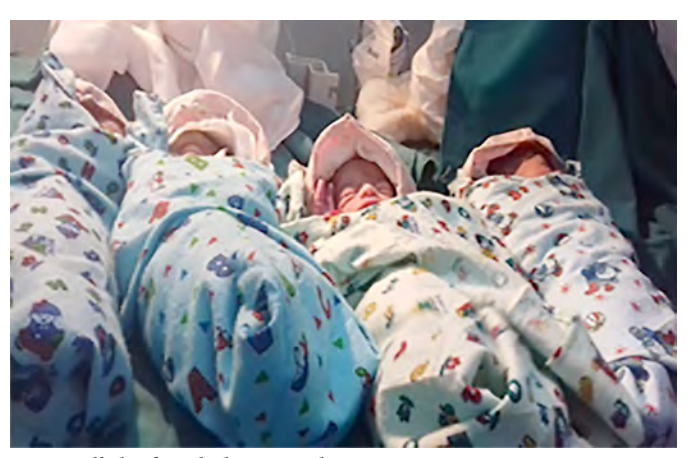
Fig 2: All the four babies together in NICU. (color pic available online)