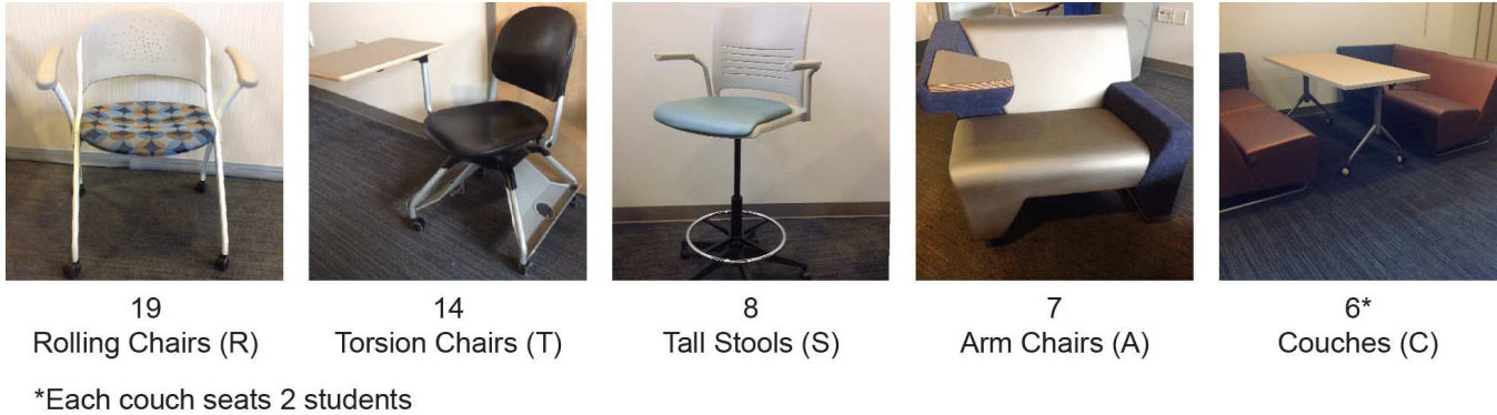
Figure 1. Seating options in flexible classroom

HDLR, hence we had free access and control (or “ownership”) of the space. Second, the learning space is one of the very few 21 st century learning spaces that existed on the Purdue campus at the time the study began.