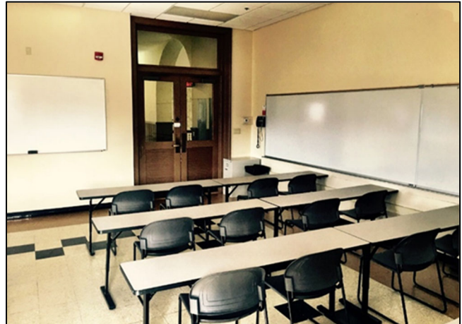
Figure 2. Traditional Classrooms

such arrangements, and inherent encouragement of student and instructor interaction (Herman Miller, 2008), the framework of social learning is a representative framework. In addition, the design promotes problem solving, collaboration, and teamwork through organization of space in spatial arrangements instead of in rows (Herman Miller, 2008), all components that are considered vital in constructing learning in a social setting. Vygotsky (1978) himself stated that “The basic characteristic of human behavior in general is that humans personally influence their relations with the environment and through that environment personally change their behavior, subjugating it to their control” (p. 51). Additionally, Coates (2005) has supported the framework of Vygotsky’s work in higher education, stating that the student engagement is foundational to the assumption of constructivism and the influence of individuals co-constructing knowledge together in activities that are purposeful, active, and collaborative.