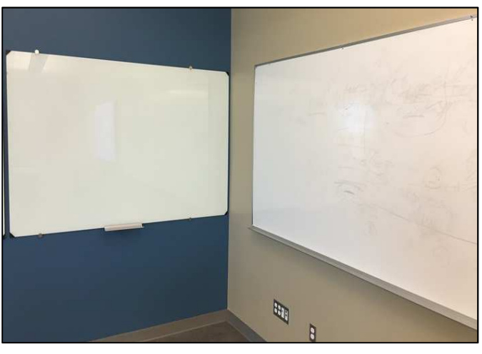
Figure 7. Glass whiteboards vs. porcelain whiteboards

Though long lasting, a noted limitation of porcelain whiteboards is "whiteboard ghosting", a phenomenon that occurs as ink residue gradually accumulates on the board over time due to improper or infrequent cleaning (see Figure 7, board on right side). Glass whiteboards, in contrast, were understood to be easier to maintain and for this reason were installed in some classrooms. The trade-off, however, particularly for students in the Round rooms, was diminished ease of viewing due to glare (see Figure 7, board on left side) from natural light. The difference in sub-group results, therefore, may be explained by the fact that the Round rooms contained more natural light when compared to the Node rooms which contained fewer, if any, windows.