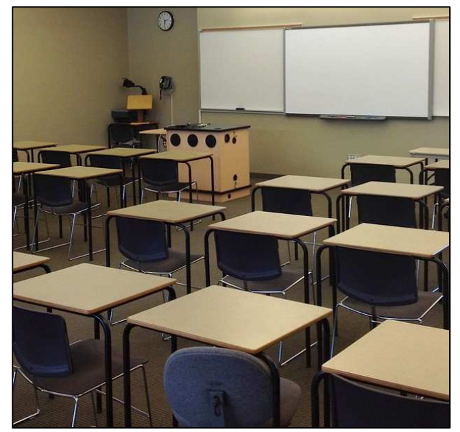
Figure 8. Traditional classroom layout

I like to see the white board and the instructor, seeing what they write down and the PowerPoint. With the round tables sometimes I'm facing the back wall and have to turn my head or turn around with my notebook on my lap. I don't really like doing that. Overall a great room for group work but not really good for an everyday lecture. (Student)