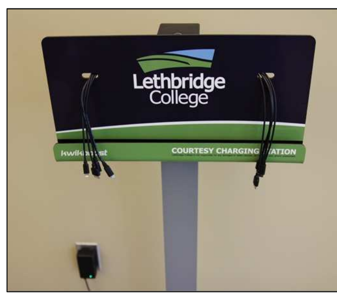
Figure 5. Mobile charging station