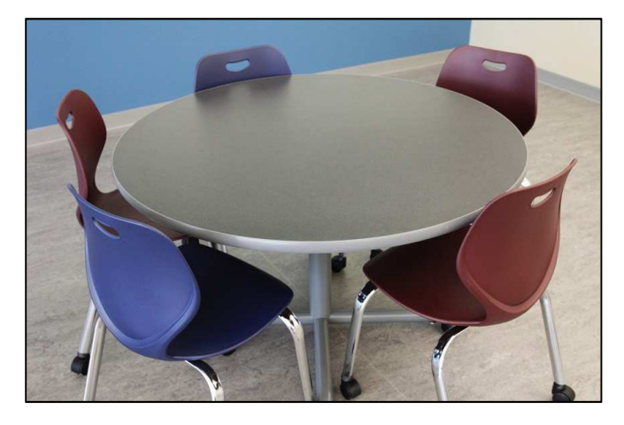
Figure 10. Round tables

Nearly half of the students in the Round rooms were dissatisfied with table stability (see Figure 10) with students in the Node rooms slightly less so. Investigation revealed that loose screws connecting the table to the table base were a contributing factor, a not uncommon occurrence with newly assembled furniture. It was also discovered that the flooring in certain Round classrooms is not level, providing further insight into the "wobbly" table effect. This information draws attention to the many factors that influence table stability, an essential requirement to ensure end-user satisfaction.