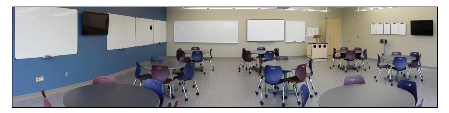
Figure 1. Round room (IB 2145)