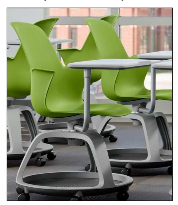
Figure 9. Node chair

Students in both room types felt the chairs were only slightly more comfortable than those in traditional classrooms. For some, the Node chairs were too small to comfortably accommodate their size, (see Figure 9) while for others the casters resulted in unintentional movement which impacted their ability to focus. In contrast, a majority of instructors preferred chairs with casters as they made classroom reconfiguration more efficient, in turn enabling a broader range of instructional strategies.