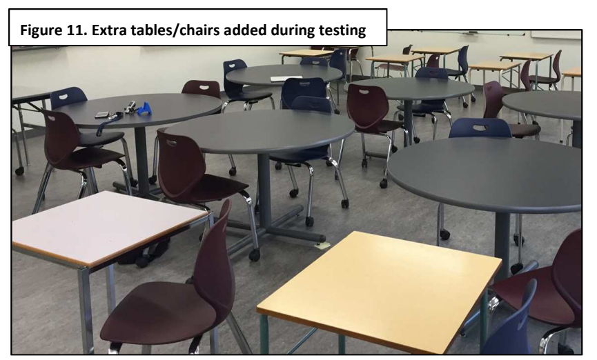
enable collaboration and group work while at the same time ensuring secure testing. Illustrative feedback as follows:

More tables as it is enticing for students to look at the exams when writing the exams in class. (Instructor)