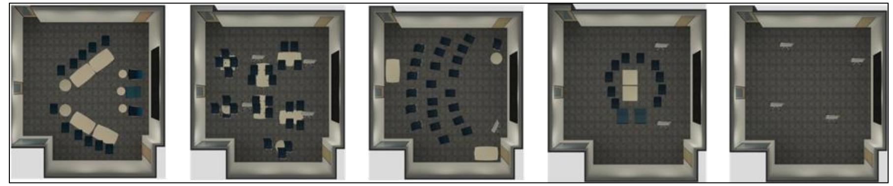
Journal of Learning Spaces, 6(3), 2017.

Figure 2 (below) . Set of images provided to faculty participants during a Re-Capture session. Each configuration was printed as a PowerPoint note on a single side of 8 ½ x 11 paper. Note: To aid communication of findings, it is helpful to refer to each configuration by a name that conjures a mental image of the space and of the kind of activities that might occur there. For example, the configurations below may be labeled as (1) debate, panel; (2) small groups or clusters; (3) presentation, demonstration; (4) group circle or fishbowl (if a second concentric circle is added); and (5) reception, poster session.