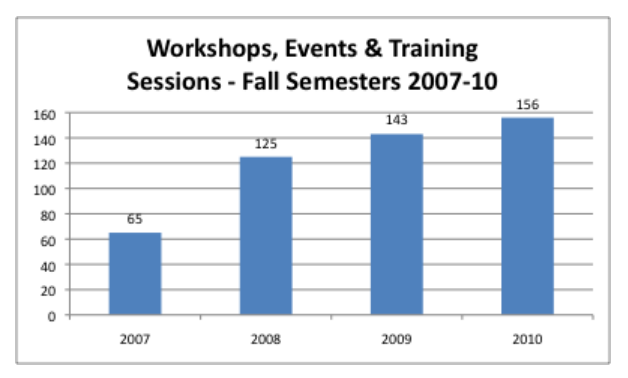
Figure 2. Training and workshop sessions history.

The importance of video editing as a daily activity at Penn for both curricular and extra-curricular activity is clear from an annual analysis of patrons using the Digital Media Lab. During the time period from July 1, 2009 to June 30, 2010, the lab served 5,611 patrons. Video was the