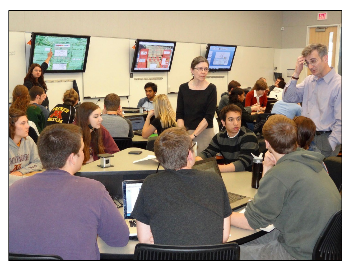
Figure 3. Instructors can approach any of the tables and answer questions more easily in the ALCs. Students say they feel "nearer" to the instructors in the ALCs.

support smaller pockets of collaboration, students who previously had difficulty communicating in big rooms because they could not assess common visual cues by listeners now have a chance to locate and hear people with whom they are speaking at the table. There is less of a need to imagine their listeners' reactions when they might be able to get direct oral feedback from them, perhaps having developed a rapport with them through active learning activities they have worked on together. The practice by instructors of consulting with each of the tables enhances social inclusion, bringing all the students nearer to the teacher. The onus of asking questions in front of the entire class is reduced to the pressure of asking a question, presumably already vetted at the table, in front of just the group.