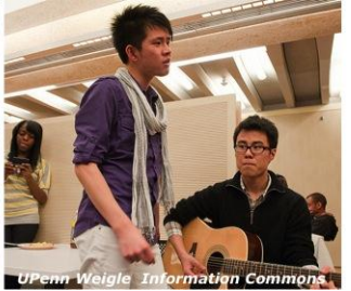
Figure 5. Consultations (L) and events (R) at Weigle Commons.

The Weigle Information Commons at the University of Pennsylvania provides a variety of technology-rich settings for students to work in, including booths, group study rooms, open study areas, and a digital media lab. They organize contests with awards and provide online tutorials and resources. The commons actively fosters community and collaboration by hosting events, offering student