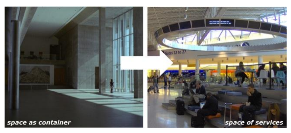
Figure 1. Moving from space as a container to a dynamic system of services. Note: Modern Art Museum of Fort Worth and Jetblue Terminal at JFK Airport, New York City, by Elliot Felix

support how people learn as Bransford, Brown, and Cocking have described (1999). Learning is happening everywhere, enabled by ubiquitous connectivity to the Internet for mobile devices like laptops, tablets, and smartphones. As Joseph Pine showed, we are in an age of mass-customization (1993), and in higher education this means moving from a "one-size-fits-most" philosophy to one of personalization to individual student needs (Department of Children, Families, and Schools, 2011). Andrew Milne argued that we have entered an "interaction age" where collaboration is the norm and where activities, services, and spaces exist to support communication among students, faculty, and information (2007). These shifts apply to both formal spaces like classrooms as well as to informal spaces like libraries, lounges, cafes, and other study spaces, whose importance Jamieson has described (2009).