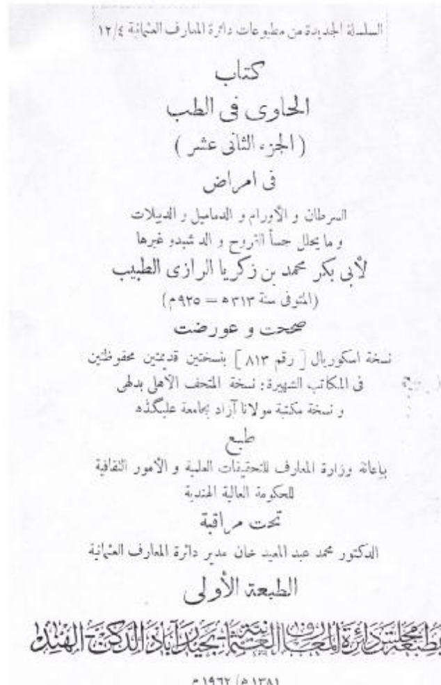
Figure 1. The front cover of Al-Hawi, Arabic manuscript, Vol.12

One of the most significant works on the description, diagnosis, differential diagnosis, prognosis and therapeutic approaches towards cancer is Alhawi by Rhazes (Figures 1 and 2), which was written prior to Avicenna's Cannon and al-Ahwazi's Kamil al-Sina'ah.