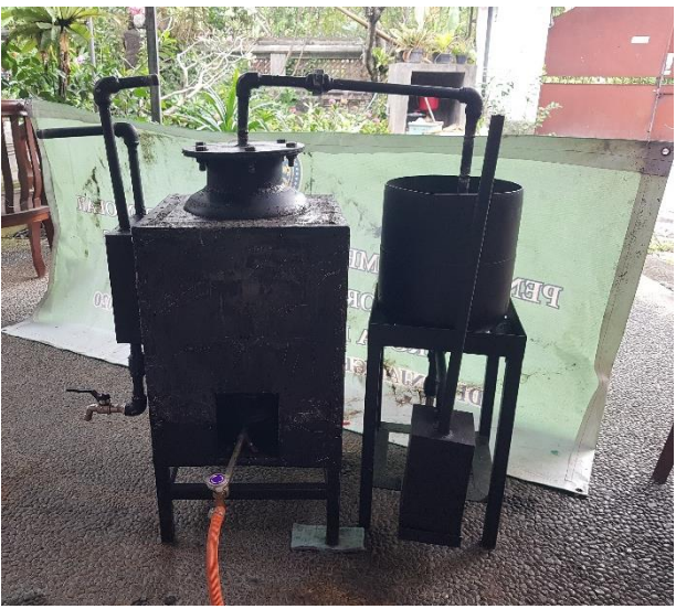
Fig. 1. Pyrolysis device

glass wool has the same design, but it is not covered with glass wool. After completion of the device design process, 500 grams of OPP plastic is inserted into the pyrolysis reactor, which will experience a heating process when the burner is turned on with a fuel source of 3 kg LPG gas, and a process of change of state in the reactor from solid to gas occurs. The condenser tube has previously been filled with water as a cooling medium, which is called the liquification process, which is the process of changing the form of gas to liquid. In this condensation stage, a distillation process occurs to produce pure pyrolysis oil. The temperature of the cooling water in the condenser was found to be 28°C. The pyrolysis process was carried out within 1 hour of each test, with a reactor temperature of 200°C. After the testing process is complete, the results of the weight of the pyrolysis oil are compared to the reactor variations equipped with glass wool and without glass wool.