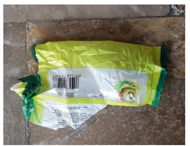
Fig. 2. OPP (oriented polypropylene plastic)