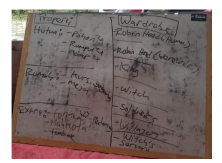
Figure 2. Drafting Plot and Characterization

From both Figure 1 and 2, we can see the creators (student A and student B) designed the plots from the scratch into a draft of the storyline by brainstorming any ideas that emerge from their brain. These ideas are made more tangible when the creators align themselves with the surrounding objects (pouring out the ideas in the whiteboard using the markers), so as it helps them able to visualize the ideas more concretely. Brainstorming ideas by making mind mapping and drafting is clearly a cognitive activity. After finding the story adaption, they give the concept to the scriptwriter, student C to continue writing the complete storyline. In this step, the group interaction ensues so that both the plot creators and the scriptwriter can have the same perspective in developing the idea from the story to be adapted. Then they start pointing the planning and choosing a cast or actor. From the draft, they can easily transfer the ideas to the script writer who are to write the whole story with a complete dialogue pertinent to social interaction among the participants.