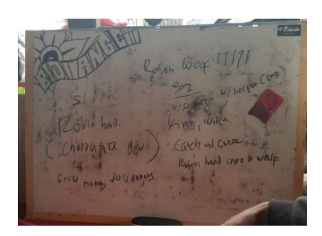
Figure 1. Concepting the Storyline

In regard to the first research question: How were the mind-body-world integrated (socio-cognitive alignment) in the process of writing a play script? we provide evidence by demonstrating some instances of how the participants develops the idea during the process of writing the play script.