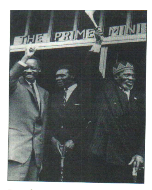
President Julius Nyerere of Tanzania, President Apollo Milton Obote of Uganda and President Jomo Kenyatta of Kenya

In the construction of the cultural notion of the African being there was representation of aspects such as language, arts, tradition, religion and, to a lesser extent, ethnicity in the verbal text. Textbook 2 and 3 raise the linguistic diversity of Africans while English, French and Portuguese retain the tag of "colonial languages". However, the same textbook contradicts itself by regarding Soyinka's novel, The Interpreters , (written in English) as "the first truly African novel" ( Textbook 3 , p.95). The visual text focused more on dress and gender roles. Even though there were also cases of generalisation of the African being, African culture was constructed as flux, with strong evidence of the acceptance of hybridisation of cultures. Figure 2 shows examples of normalisation of hybridisation in terms of attire and accessories. Therefore, the African being is largely represented as a cultural hybrid, with a marked representation of the influence of Western culture. Where a distinction is made, African culture is represented as traditional, while Western culture is represented as modern.