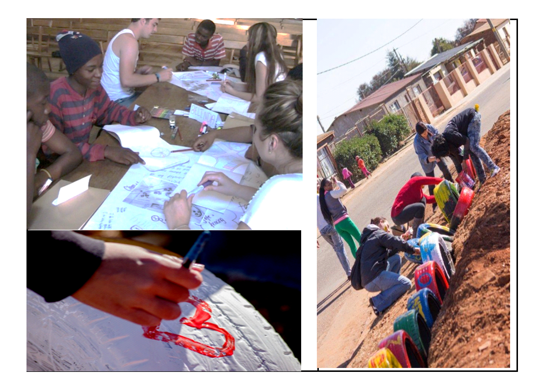
Figure 1: Participants collaborating on project

negotiated between the parties involved. The conversations that took place between the participants in this study were aimed at arriving at common understandings on the given task (developing art work for the park), raising awareness about problems, debating particular issues and collaborating on a final product (Helguera, 2011). In most phases of the process, the conversations between the participants were the core source of meaningful and mutual knowledge generation. In the end, the pragmatic artifacts created reflected an understanding of the real needs of the community members – they painted large tractor tyres which they then embedded in the ground (so they were not stolen) to demarcate the open space and make it attractive to children as a play area (see Figure 1). Thus, through socially engaged art practices, they could agree on a solution that was aptly suited to this particular environment, rather than an abstract piece of art that would probably have been vandalized or stolen.