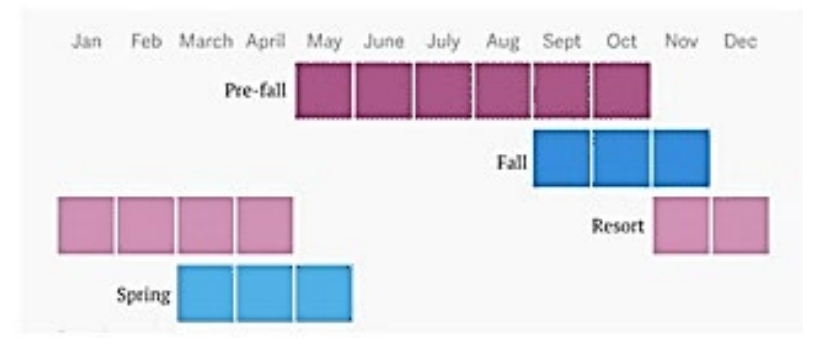
Figure 5. Fashion Calendar

The enchantment over Western seasonal fashion is also perceptible from the display of Pre-Fall and Pre-Spring. These pre-collections are created to shorten the wait and warm the consumers up ahead of new main collections. This way brands can ensure their retail stores are never left empty, and thus continuously make profits.