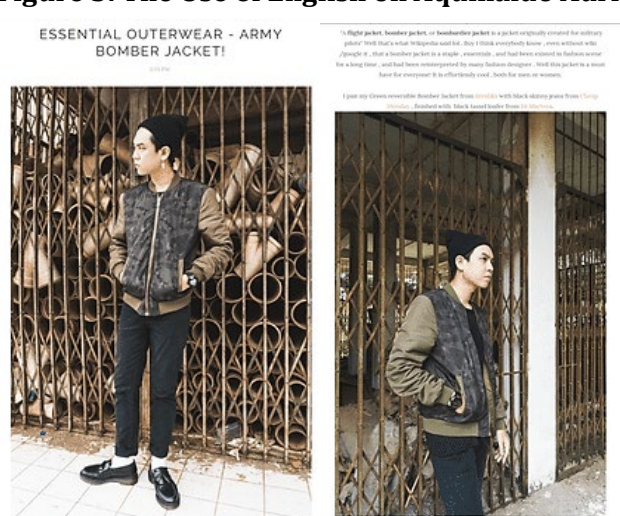
Figure 3. The Use of English on Aquinaldo Adrian

by the bloggers, but also extended by the audience. The UCC nature of fashion blog encourages the Indonesian audience to be fashion bloggers too. After witnessing the success that Siantar has reached, English becomes their language of choice. Regardless of how imperfect their competency might be, Indonesian fashion bloggers insist on writing in English, as seen below.