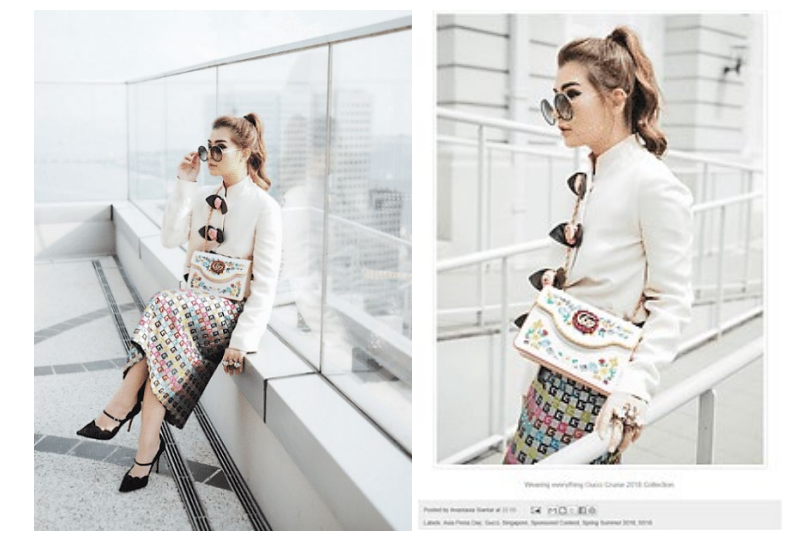
Figure 6. Seasonal Fashion on Brown Platform

In Indonesia, the temperature difference in the trans-seasonal weather, from rainy to dry, or vice versa, is not glaringly contrast. Indonesians thus do not need a whole wardrobe change every season. However, the trans-seasonal collections can be seen in Indonesian fashion blogipelago. One of them is Siantar, clad in Gucci Cruise 2018 collection (see Figure 6). Ineptly, her OOTD is not photographed in line with the reason why the collection was created (i.e., sailing on a cruise or 'staycationing' in a resort. This fact indicates that the collection is not served by fashion blogger Indonesian for its functionality, but rather for its sign-exchange value.