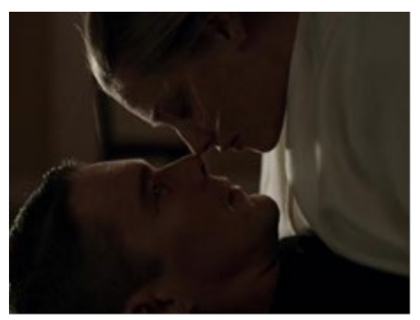
Source: First Reformed (Schrader, 2017, 01:22:20) Figure 10. Mary in white outfit and Toller in black outfit.

Journal of Language and Literature ISSN: 1410-5691 (print); 2580-5878 (online)