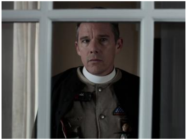
Source: First Reformed (Schrader, 2017, 01:41:00) Figure 6. Reverend Toller, wearing a suicide vest underneath his cassock.

and he deliberately ignores doctor's warning about the possibility of stomach cancer. Reverend Toller also takes upon himself to pick up where Michael left off and starts to assemble the suicide vest that formerly belongs to Michael. Near the end of the film, Toller wears a suicide vest underneath his cassock, which suggests that his idea of fixing the state of the world is by destroying it.