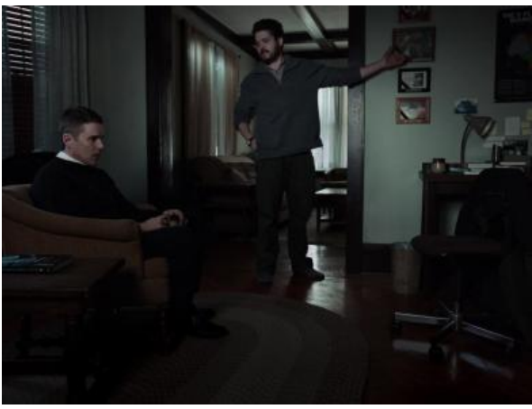
Source: First Reformed (Schrader, 2017, 00:17:23) Figure 5. Michael (standing), showing Reverend Toller (sitting) framed photographs of environmental martyrs.

MICHAEL. Well, every week, activists are killed trying to protect the environment. A hundred and seventeen were killed last year for their beliefs.