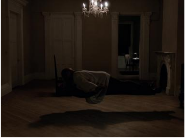
Source: First Reformed (Schrader, 2017, 01:22:49) Figure 7. Mary (top) and Toller (bottom) are levitating.

The first scene to be discussed is the magical mystery tour scene (01:23:02 -01:25:19). During her surprise visit to Toller's parsonage due to sleeping difficulties, Mary Mensana is half-telling and half-persuading Toller to join an activity that she and Michael used to do called the magical mystery tour, in which they would lie on top of each other, facing each other, with full clothes on. They then would try to get as much body-to-body contact as possible while breathing in the same rhythm. Toller eventually agrees to do that with Mary, so he lies on the ground while Mary lies on top of him. As soon as their breathing is in sync, they start to levitate from the ground.