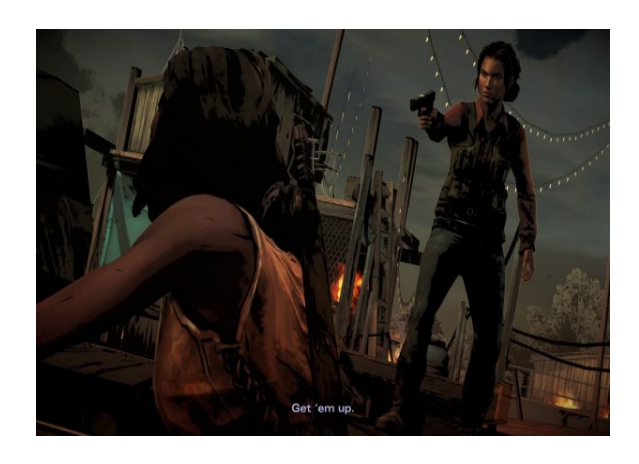
Datum 1 Picture 1 Do Nothing When Being Threatened by a Gun

Michonne, the protagonist, tried to escape after burning the enemies' base camp by using the flare gun. She does not intend to burn it at first, but when she shot the flare gun, it exploded and burned down the place in a short amount of time because the basecamp was primarily made of wood. During the escape process, she fought and killed some of