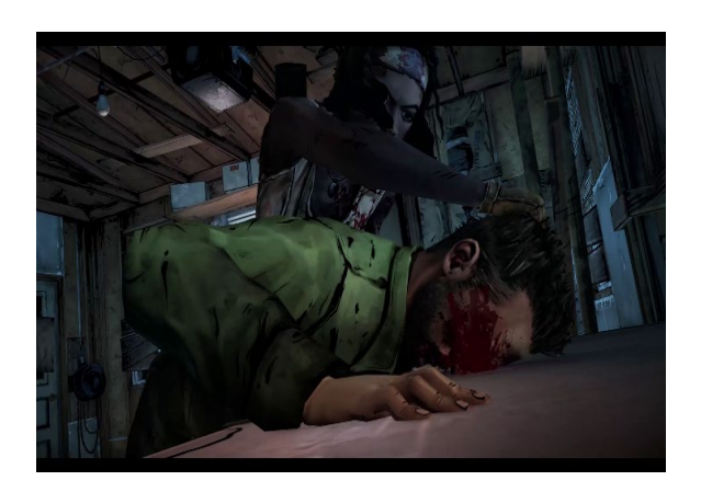
Datum 4 Picture 4 Smashed Randall's Face to the Table

During one of the scenes, the protagonist was involved in hand-in-hand combat with the enemy's leader, Randall. She tried to fight him back to protect everyone from Randall's harm, but he was too strong for Michonne to be fought alone. He punched Michonne several times until one of Michonne's friends hit Randall's head with a shovel. Randall then fell to the ground while holding his head because of the pain caused by the sudden attack. When Michonne regained consciousness, she became furious at Randall for what he did. Michonne was highly frustrated and upset with Randall. Michonne then finally got her chance and attacked Randall, smashed his face to the table several times to weaken him to be tied so that she could use him as a bargaining chip to release her friends. whom Randall's minions captured.