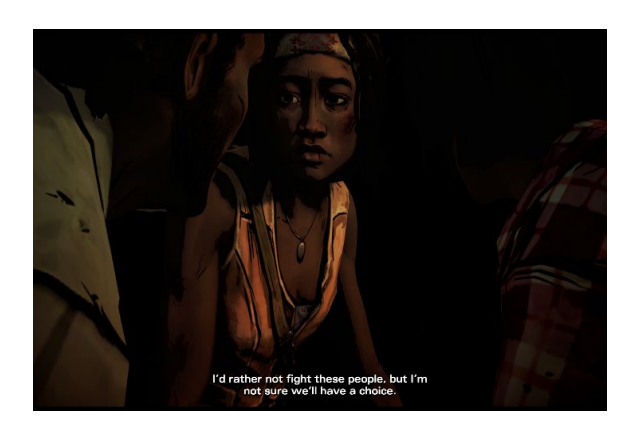
Datum 3 Picture 3 Stating That They Don't Have a Choice

After breaking free from the underground where Michonne and her friends were held captive, they hid inside a boat and tried to figure something out to escape from the island. During that situation, everyone was scared if they could not make it out alive. Sam, one of Michonne's friends, suggested that they should just make an offensive attack to escape from the community to keep surviving. Pete disagreed with the idea at first, and then Michonne replied by saying, "I'd rather not fight these people, but I'm not sure we'll have a choice." which indicated that she was scared too, but in order to survive and escape, they had to fight back because they had no other choices or options on how they could escape. By the time, the enemies had been looking around for Michonne and her friends.