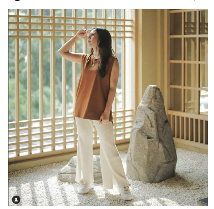
Figure 5. Female Influencer 'JM'

Lastly, framing is related to how the elements in an image are placed together as one unit (i.e., maximum connection) or discrete units (i.e., maximum disconnection) through frame boundaries or color schemes. In most of the influencers' photos, the primary elements, that is, the influencers, are situated as a unit integrated with the background.