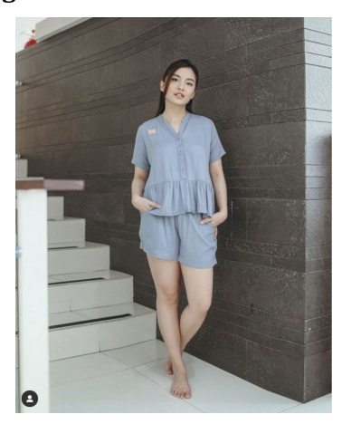
Figure 1. Female Influencer 'CO'

Kress and van Leuween (2006) noted that what is put on the left tends to be the information that the viewers may already know, whereas anything on the right is 'new' information considered that emphasized in the image. In the influencers' posts, the context of the image (e.g., the place, theme) is put first on the left, followed by the influencers wearing the advertised clothing items, which means that the focus is on the influencers and the products themselves. For example, as shown in Figure 1, the setting of the image, represented by stairs, is a homey place, which corresponds to the clothing item being advertised, that is, pajamas. Similarly, the focus on the top of the image is the influencer's face, representing the 'ideal.' This implies that the influencers, including the one shown in Figure 1, intend to establish familiarity with the viewers by showing their faces that the followers surely already know. The rest of the picture downwards represents the 'real' information, referring to what the influencer advertises. Finally, in almost all the images, the products, including clothes, bags, shoes, are situated in the center of the image. becoming the main highlight of the post, as depicted in Figure 1, where the pajamas are exactly in the center of the dimension.