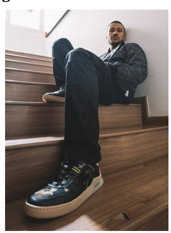
Figure 4. Male Influencer 'CJ'

In a few posts, the male influencers may shift the prominence of the image to the products, as illustrated in Figure 4. The shoes are situated in the image's foreground, with the influencer in the background. However, regarding the shot angle, the whole body of the influencer is still shot, indicating the importance of influencers to show themselves.