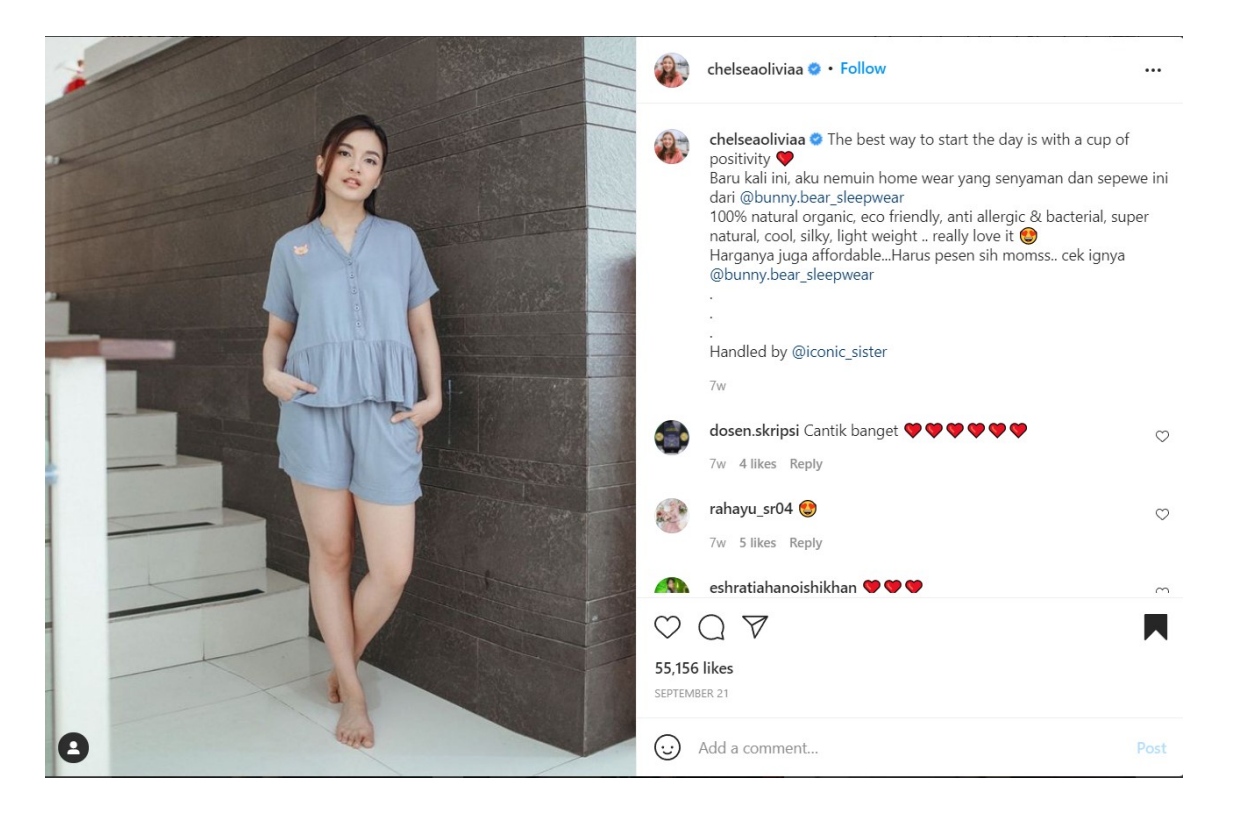
Figure 9 - The Full Instagram Post of Influencer 'CO'

In Figure 9, the image serves as the 'given' information to show what the product looks like and in what setting the product is appropriate to be worn, in addition to the influencer herself. The text then 'asserts' this information by providing the brand name of the products and how to purchase them. In comparison, Figure 10 shows an example of complementation, where the image and the text are not seemingly related but add meaning to each other. As illustrated, the caption does not mention anything about the product and narrates the expression of the influencer, whereas the image shows the brand's name on the clothing. The analysis shows how both types of text-image relations are evident among male and female influencers, entailing no difference in the advertisements posted by both genders.