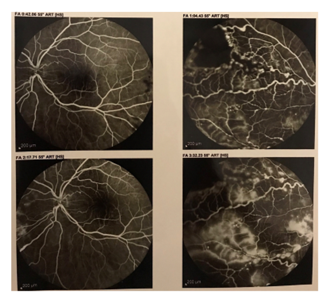
Figure 2. Fundus fluorescein angiography. Vascular tortuosity and fusiform aneurysms with leakage and non-perfusion areas in the mid-peripheral and peripheral regions.