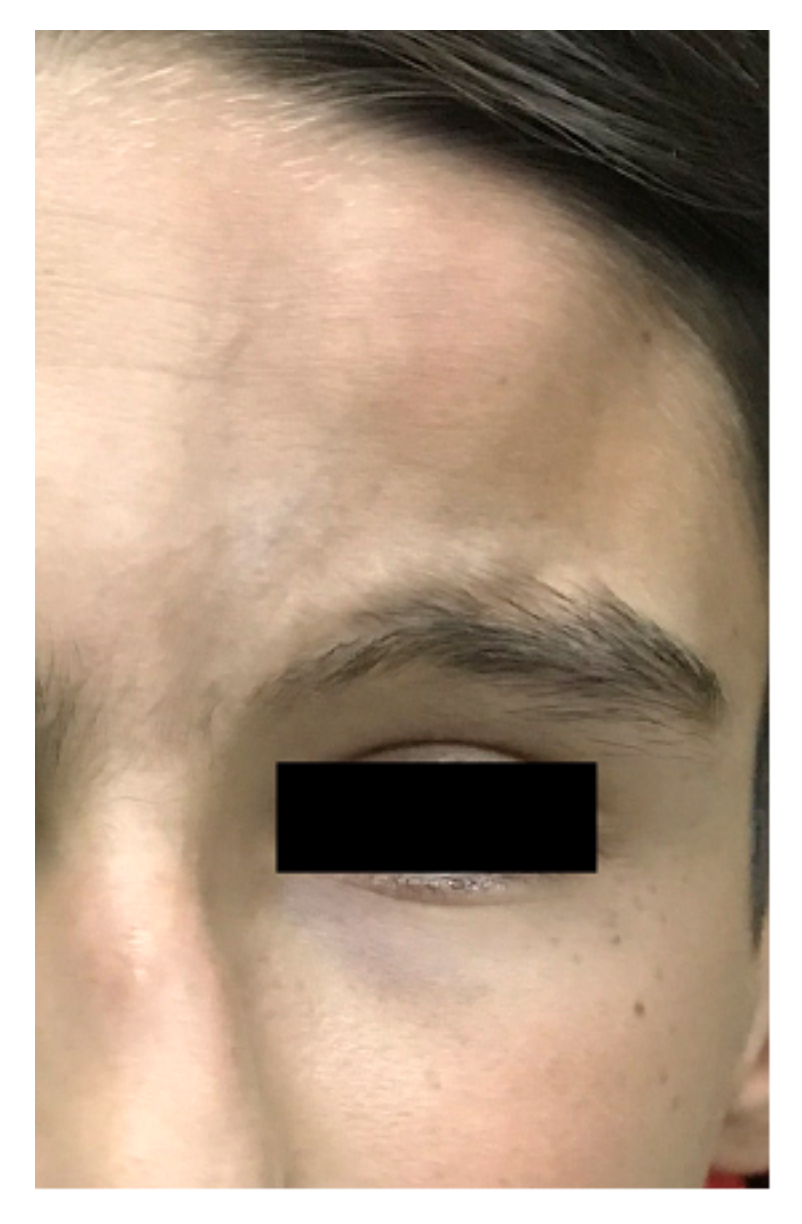
Figure 1. Photograph of the patient showing depressed left forehead skin lesion (en coup de sabre).

To the best of our knowledge, there have been only five previous reports of this Coats'-like response in patients with ECDS. [8–12] One of them resulted in exudative retinal detachment and severe vision loss in early childhood. [8] Unlike previous reports, our patient regained nearly normal vision following appropriate treatment. We believe that treatment with intravitreal anti-VEGF agents and/or laser photocoagulation may be beneficial for patients with Coats' like response. This treatment may halt or at least delay progression of the retinal abnormalities.