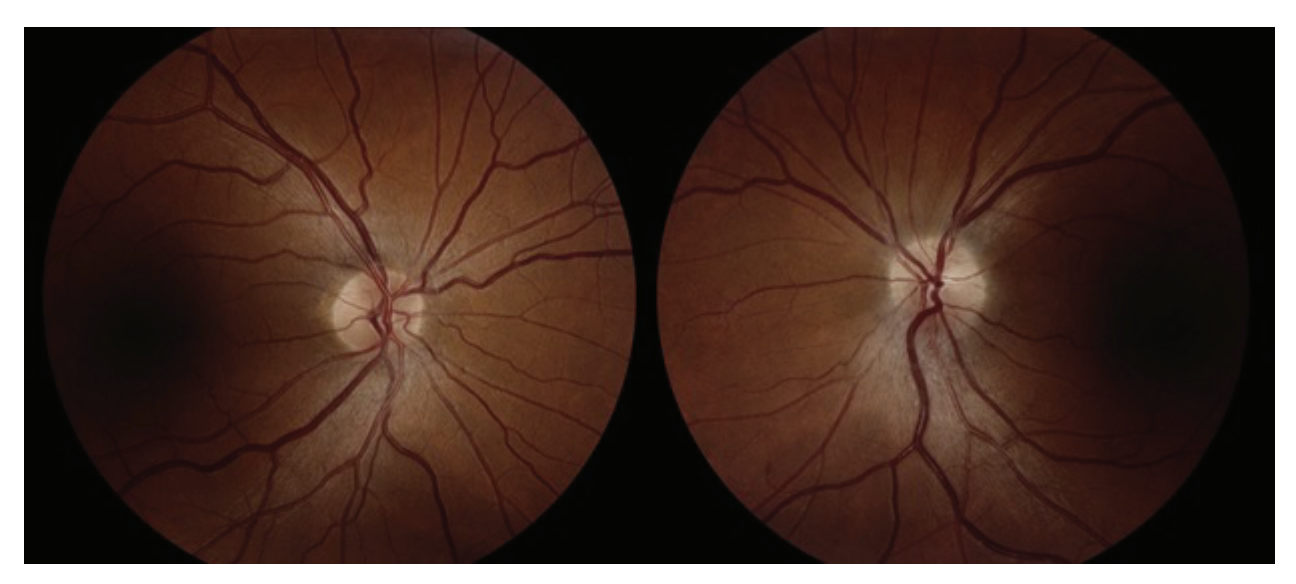
Figure 1. Color Fundus Photography taken at the Presentation. Disc margins are blurred along inferior border OS.