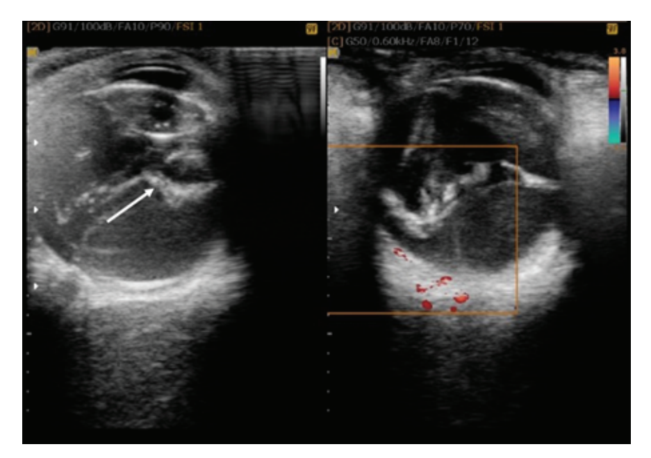
Figure 3. Color Doppler ultrasonography shows no flow in the membrane seen in the left figure, ruling-out RD. The avascular membrane has been marked in the right figure.

Of the 65 patients, RD was diagnosed in 26 (40%) patients on CDUS and in 23 (35.4%) patients during vitrectomy. As for the type of RD, all patients had rhegmatogenous RD.