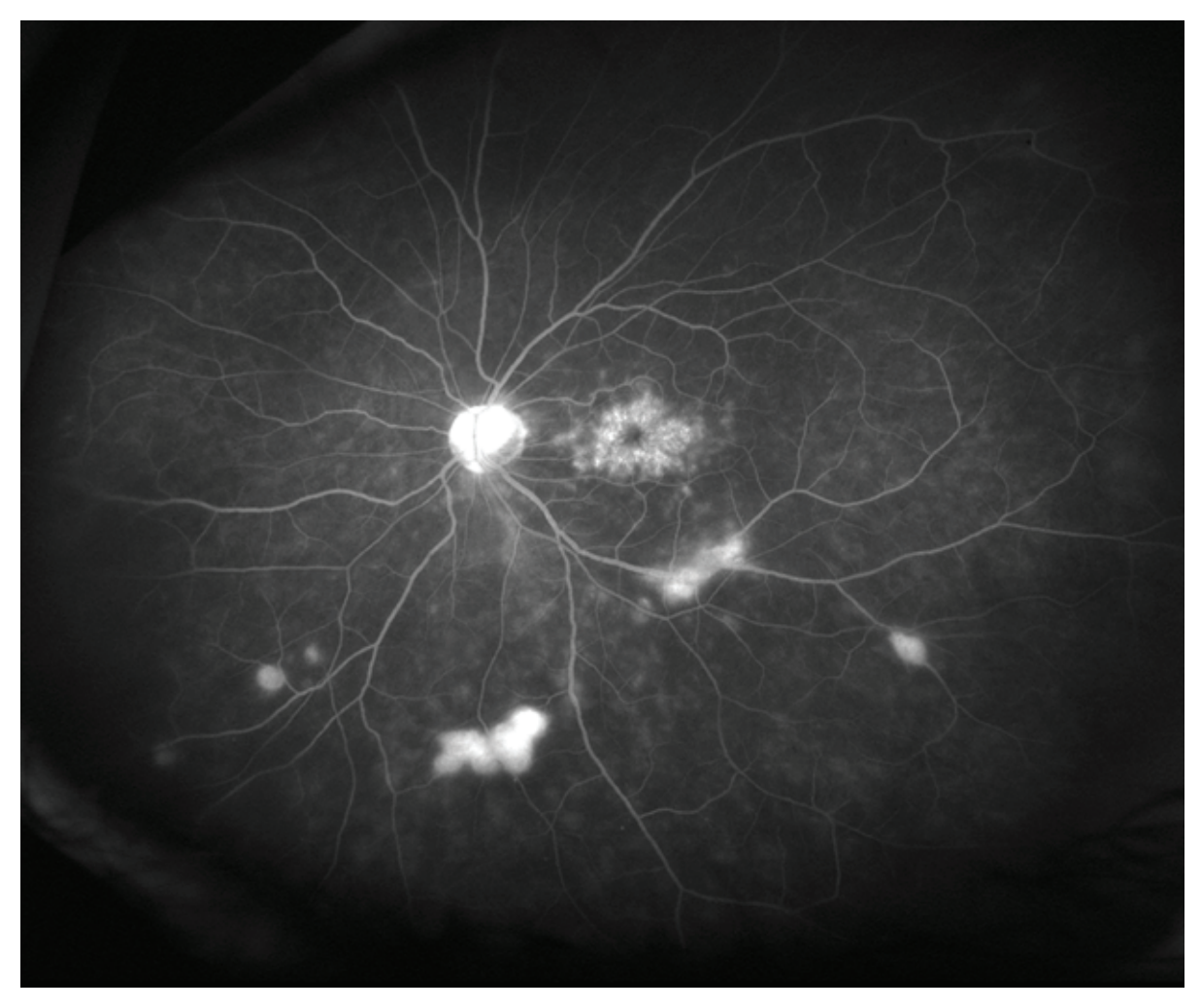
Figure 1. Fluorescein angiography of a 67-year-old female with history of rheumatoid arthritis treated with etanercept who developed uveitis and retinal vasculitis three months after the initiation of etanercept. Etanercept was discontinued and infliximab was started which resulted in resolution of ocular inflammation.