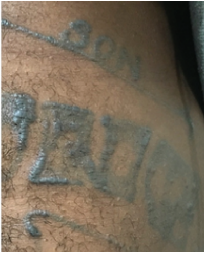
Figure 3. Inflamed, indurated skin tattoos in a young patient with tattoo uveitis.

with bilateral anterior uveitis usually within a week of drug initiation.<sup>[28, 41, 55]</sup> Topical metipranolol, a nonselective \beta -blocker used to treat glaucoma, has been linked to granulomatous anterior uveitis most commonly when used at a higher concentration of 0.6%. [28, 56] Onset ranged from 2 to 31 months, and strong dechallenge and rechallenge data have also been reported.<sup>[41, 56]</sup> Other medications that can rarely cause uveitis include podophyllum, capsaicin. betaxolol. oral contraceptives, diethylcarbamazine, corticosteroids, quinidine, topiramate, and tuberculin skin tests. [6, 8, 14, 28] Almost all of these cases resolved with cessation of the medication and initiation of topical steroids. [6, 14, 28]