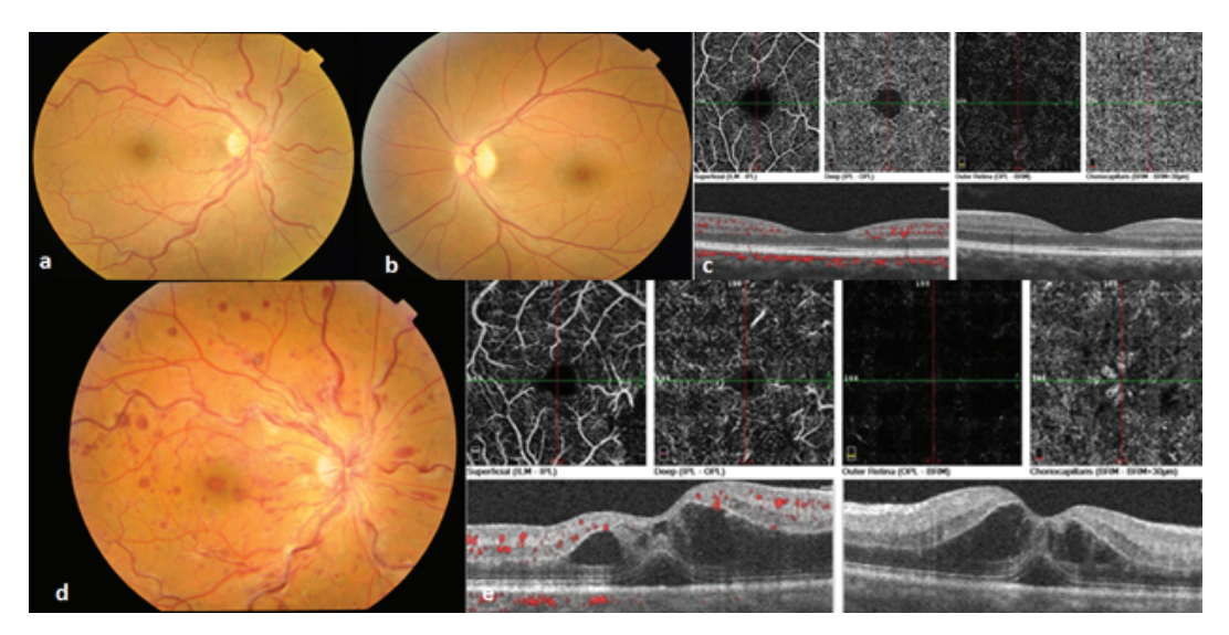
Figure 1. Fundus photos of the right (a) and left (b) eyes at presentation. Right eye funduscopy shows an increased vascular tortuosity and retinal dot and blot and flame shape hemorrhages that is compatible with an impending central retinal vein occlusion (CRVO). The normal optical coherence tomography angiography (OCTA) at presentation (c). After three weeks of follow up, her fundus photo was compatible with CRVO diagnosis with significantly increased vascular tortuosity and retinal hemorrhages (d). Her OCTA showed obvious macular edema and sub-retinal fluid in fovea (e).

detachment, and multiple evanescent white dot syndrome (MEWDS). ^{[2-4]}