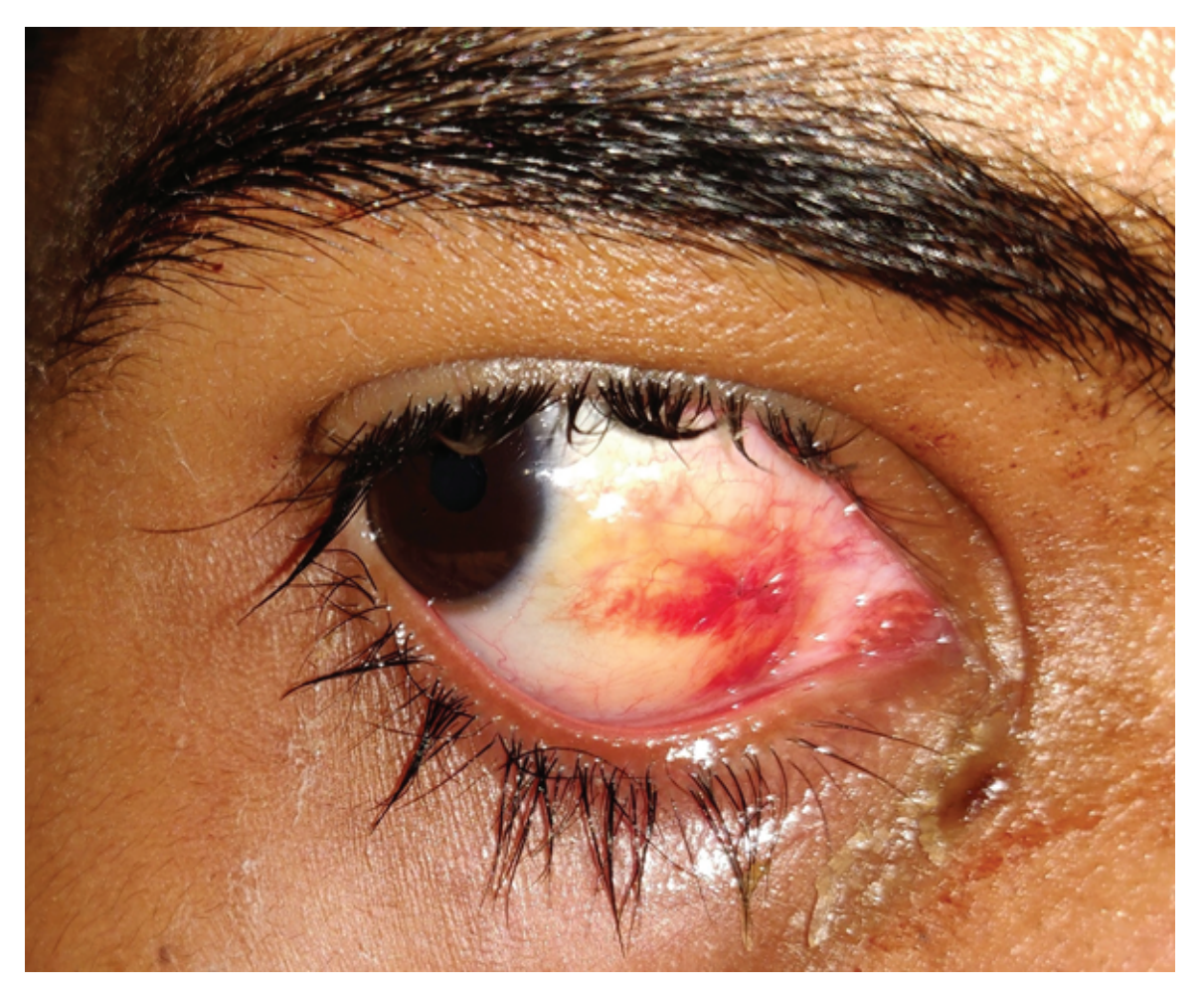
Figure 2. Image acquired one day after excision of the lesion. The conjunctival defect is apposed with 10–0 nylon sutures.