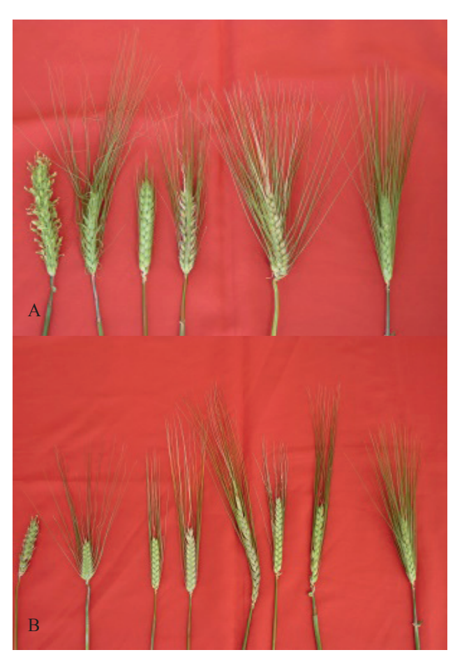
Figure 2. Spike morphology mutation types in barley cv UNALM 96 irradiated with 200 Gy of gamma ray at M<sub>2</sub> generation (A:6 row with different types of awn, B:two row with different types of awn. La Molina-Peru

Morphological characteristics mutations—In the \rm M_2 and following generations, a wide mutation spectrum was identified. The population that developed with the dose of 200 Gray was studied and the following modifications were found: stem color (1.68%), auricle leaf color (3.3%), spike morphology (4.78%), awn color (2%), awn —light curly (0.43%), awnleted (5%), elevated hood (0.18%), sessile hood (0.19%) and naked grain (0.70%). Some of these spike morphology mutations are presented in Figure 2.