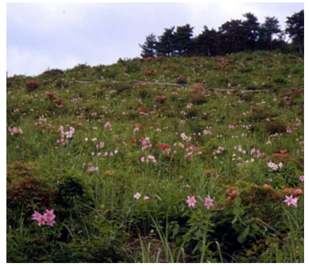
Figure 3. Rose Lily in Atsushio-kano