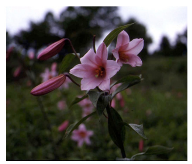
Figure 2. Rose Lily in Mt. Azuma