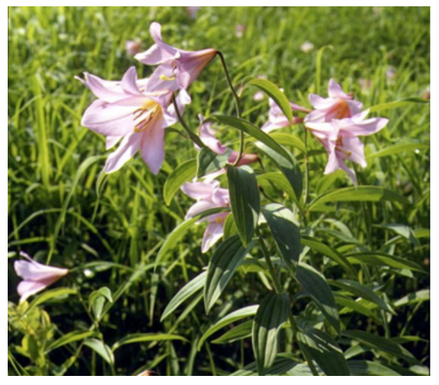
Figure 4. Rose Lily in Nango