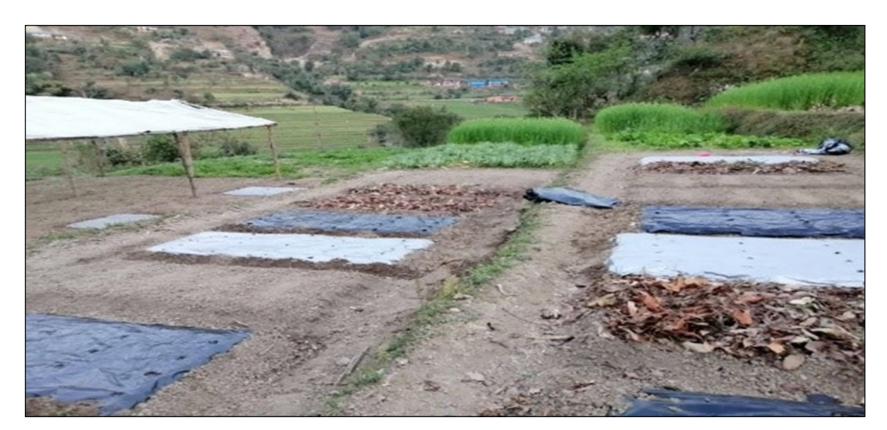
Figure 3. Establishment of experimental plots: (M0) No Mulching, (M1) Plant Residue, (M2) Black Plastic and (M3) Silver on black Plastic

Urea, DAP (di-ammonium phosphate), and MOP (Muriate of potash) were used as per the national recommended dose, i.e., 140:220:100 kg/ha. A full dose of phosphorus, potassium, and half