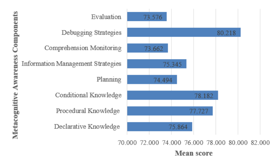
Figure 2. The profile of students' metacognitive awareness in each component

the effects of hybrid project-based learning (Husamah, 2015) and the use of Google Classroom in hybrid learning (Susilo, Kartono, & Mastur, 2019).