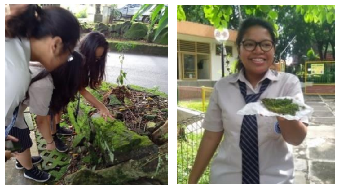
Figure 2. Students' activities to get Bryophyta sample as scientific evidence

Student learning activities (Figure 2) showed that students are invited to link contextual learning to Bryophyta's subject. This activity affected increasing scientific literacy. Increased scientific literacy indicates that students have a curiosity about science issues and practice science directly. When students pay attention to their learning behavior, it can be empowering their experiences and form scientific expertise from various sources using scientific methods. Dragoş and Mih (2015) explained students could achieve their learn best if they could employ a variety of data collection methods. Moreover, setting up an outdoor class as a learning activity will allow students to observe the phenomena by themselves and empower their scientific abilities to be more optimal (Feille, 2017; Fettahlioğlu & Aydoğdu, 2020).