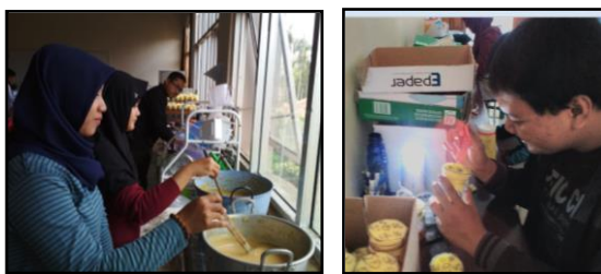
Figure 6. Two students were cooking the cultured media (left) and a student was isolating the mature pupae

Afterward, students should design their research procedure. The project assistants just guided them to keep their research design in line with the Genetics course design. Afterthat, students should write their procedure in their journal book. Then, their procedure was shown to their project assistant. If the project assistant agrees with their procedure, students were allowed to begin their project research. Students should managed their schedules to cook a media, to rejuvenate the cultures, to isolate the pupaes, and to crosshybrid their flies. These activities tried their assiduity and responsibility, some of the scientific attitudes that all scientists must possess (Rao, 2004). Figure 6. shown several activities conducted by students during project activities.