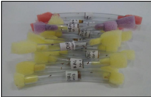
Figure 5. The dark pupaes isolated in small tubes

used for crosshybrid steps. Why? Because the crosshybridization need a pair of flies that never copulate, so the data from hybridization is not biased.