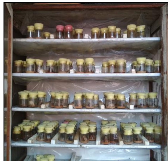
Figure 2. One of culture case in Genetics Laboratory, UM

There are many D. melanogaster strains that can be found in Genetics Laboratory Faculty of Mathematics and Natural Science, State University of Malang. The flies cultured were kept in two culture cases (Figure 2.).