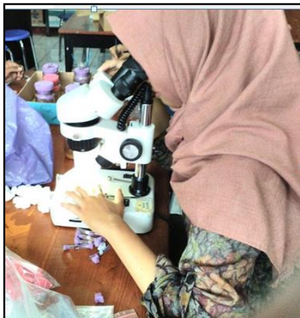
Figure 3. One of the students was observing D. melanogaster phenotypes

In Genetics I, each class was divided into 16 genetics project groups. Each group has different research topic and several group got D. melanogaster strains that correspond with their research topic. In Genetics I, the strains in each group were decided by project assistants, not students themselves. Groups that got Mendel I Law, epistasis, and lethal gene projects acquired strains that could be crossed in the monohybrid system, Mendel II Law in dihybrid system, whereas sex linked and nondisjunction projects acquired gonosome mutants. The determination of strains in each phenomenon was in line with several previous researchs studying the potency of D. melanogaster as learning media (Fauzi & Corebima, 2016, 2016a, 2016b).