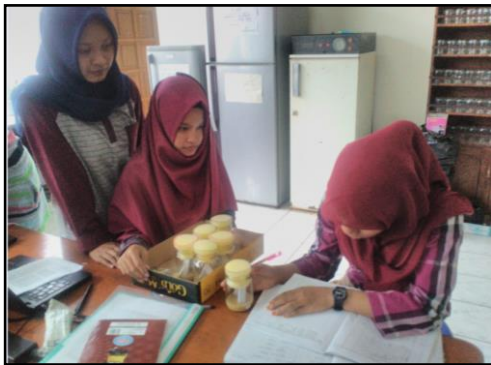
Figure 7. The projects assistants was checking the journal book of genetics students

progress activities. In the progress activities, project assistants recorded the research progress of each group. The progress activities were conducted twice time in each semester.