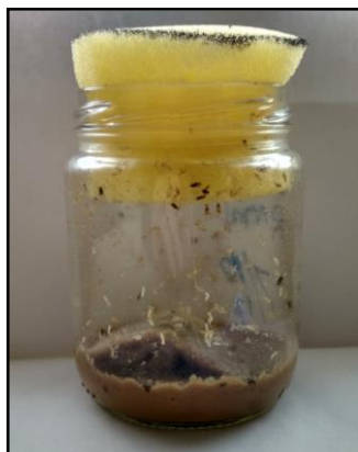
Figure 1. A culture bottle of D. melanogaster

In Genetics Laboratory of Faculty of Mathematics and Natural Science, State University of Malang, D. melanogaster was cultured in 200 ml glass bottles with the height is 9 cm and the diameter is 7 cm. The glass bottles filled with 25-35 ml media and the top of the bottles is closed by cork (Figure 1.).