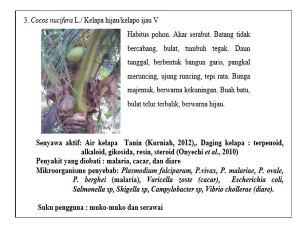
Figure 3. Design of layout pocketbook before revision