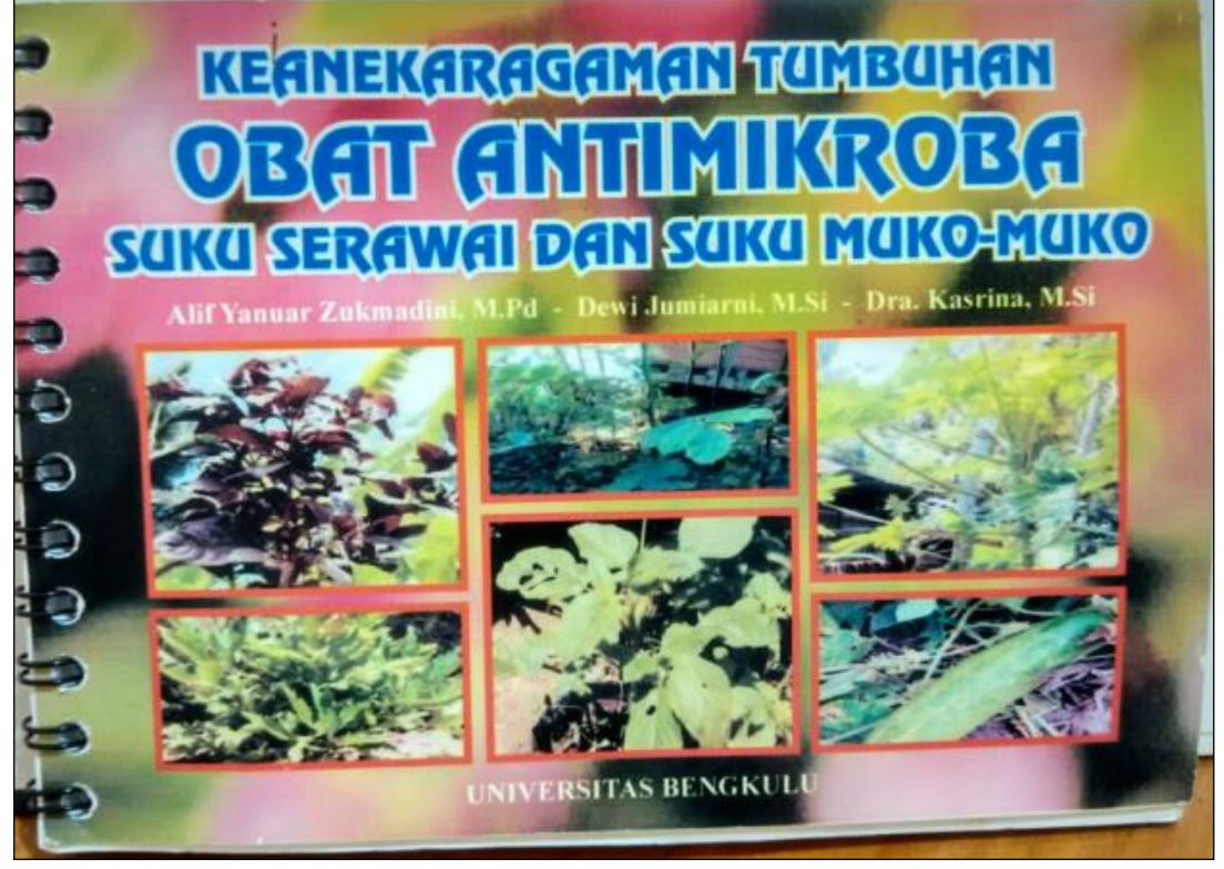
Figure 2. Design of pocketbook cover after revision