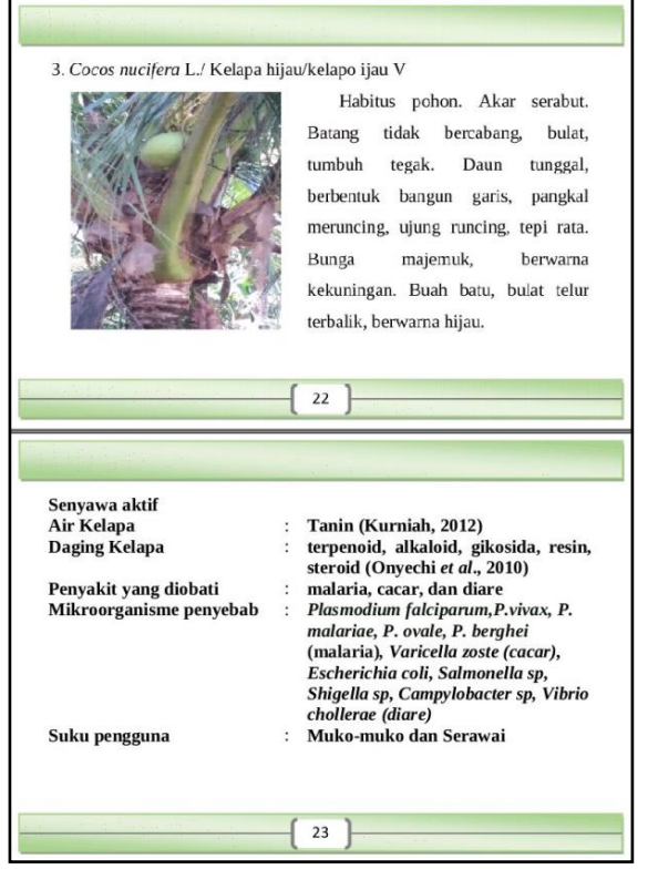
Figure 4. Design of layout pocketbook after revision

Data of antimicrobial medicinal plants that were collected from an interview with battra then were arranged to be a pocketbook. Pocketbooks that have been designed are then validated by validators and users. Based on the validation results, pocketbook assessment scores fall into either category, but it needs to be improved on the pocketbook.