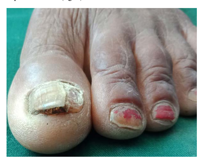
Figure 1: Clinical photography of a 40-year female with asymptomatic nodular growth in the left greater toe beneath the nail plate.

A 40 years female presented with a painless nodular growth beneath the nail plate in the left greater toe. On examination, there was a fleshy nodule of size 1.5 x 2 cm over the subungual region in the greater toe with a displacement of the nail plate. There was brownish discoloration with longitudinal striations in the overlying nail plate. There was no history of trauma, bleeding, erosion, and pain on exposure to cold (fig. 1).