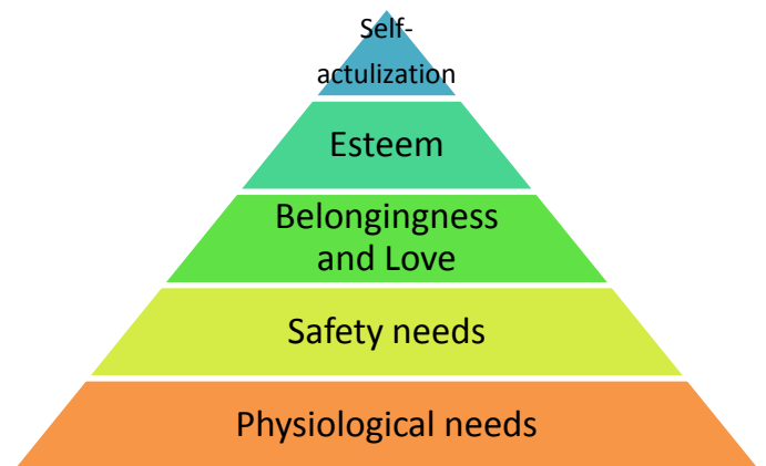
Fig.1. Maslow's Hierarchy of Needs

and self-actualization (Gerriget al. 2007). These five levels are often described like a pyramid, with fundamental needs at the bottom and self-actualization at the top (Fig.1). Physiological needs including food, water, house and so on, are the fundamental needs in daily life and these basic needs play dominant roles and once it cannot be satisfied, a strong motivation will be aroused to fulfill the demands. Safety needs are also essential needs for human beings, which mean that people prefer the world to be safe, predictable, ordered and organized, while all unexpected and dangerous events would bring panic to public. In this sense, both of physiological needs and safety needs should be viewed as fundamental needs and motivations for human beings.