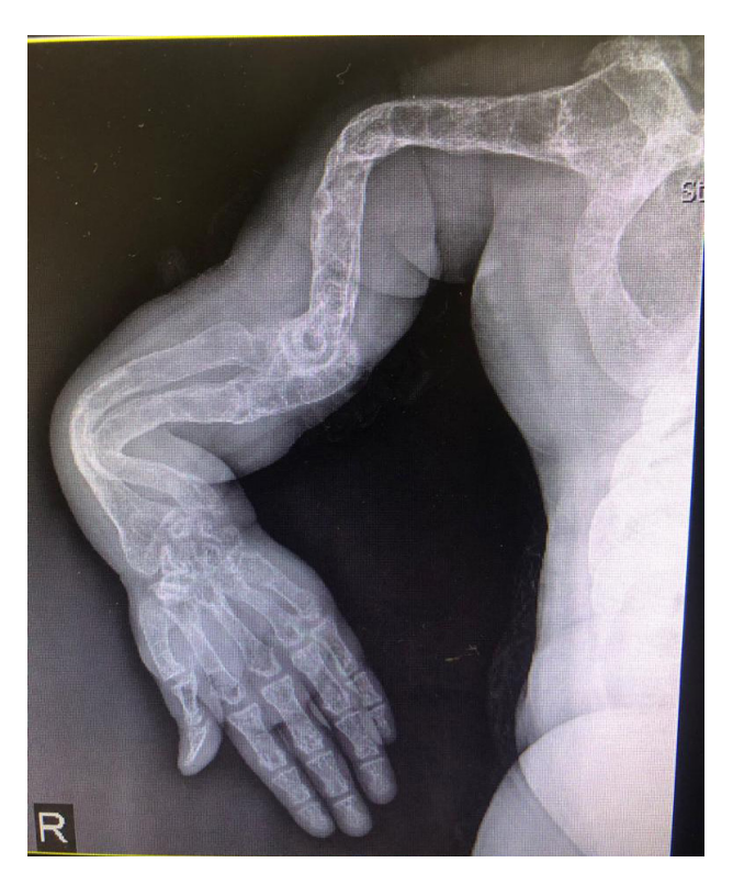
Figure 2: X-ray reveals severe bowing of the upper and lower limbs and marked generalized osteopenia.