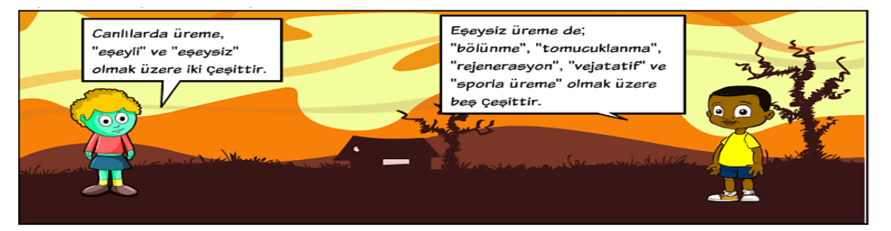
Figure 1 Reproductive

A: Reproduction in living things is of two types, "sexual" and "asexual". B: Asexual reproduction too; There are five types: "division", "budding", "regeneration", "vegetative", and "spore reproduction".