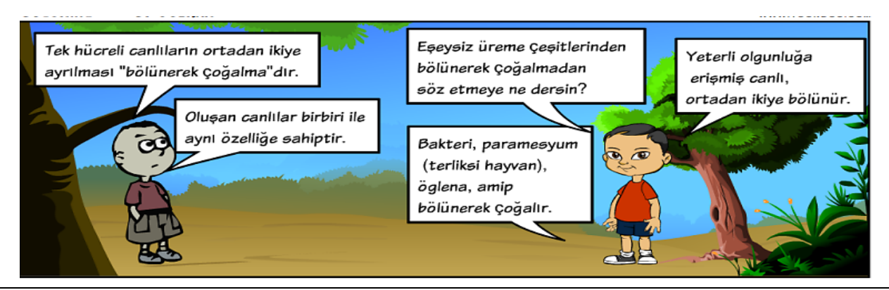
Figure 3 Asexual reproduction

E: How about talking about asexual reproduction types of reproduction by division?