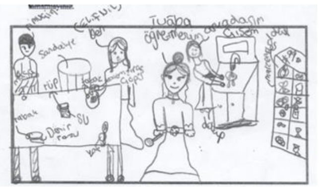
Figure 2 Formal sub-theme of the place theme, student drawing (Private School)