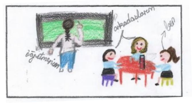
Figure 3 Sub-theme student drawing presenting the subject of the theme of teacher behavior (Private School)

& Arici, 2015). However, it has been revealed that only one student per school sees the teacher as the record holder. The literature does not support this result of the study. That may be that even if the teacher keeps records during the lesson, it is not reflected in the student's image.