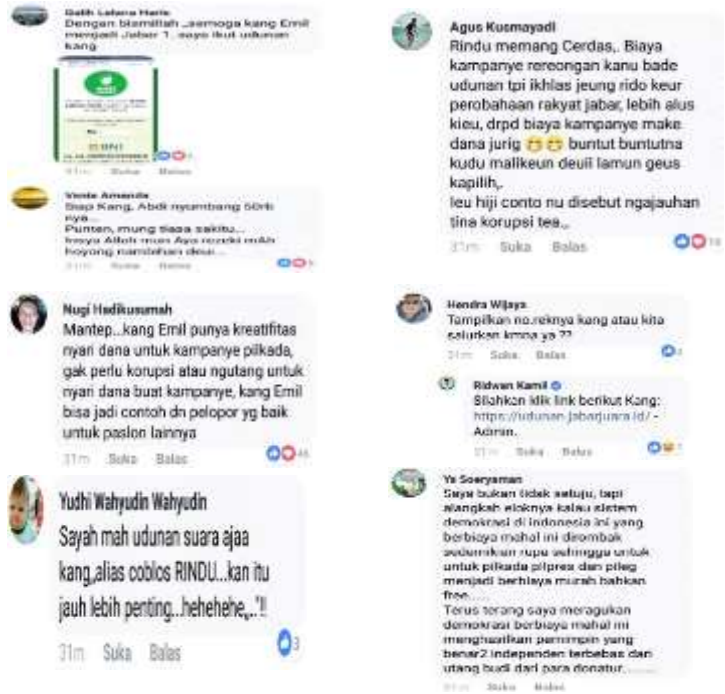
FIGURE 2: COMMENT OF FACEBOOK USER

This is a simple description of the basic structure of netizen discussion related to video crowdfunding on FB Ridwan Kamil