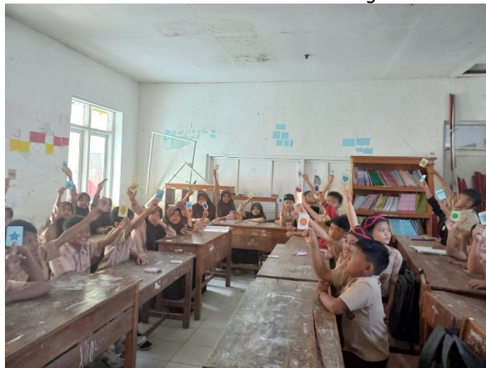
Figure 2. Using Flashcard

As a result of data analysis, researchers focused the results of the study on learning media to introduce English for early childhood, namely flash cards because it was seen that children focus on images so that teachers can develop listening and listening skills when teachers explain them. According to (Jazuly, 2016) during learning activities using flash cards, children like learning media that are visual such as flash cards that are made interesting and fun.