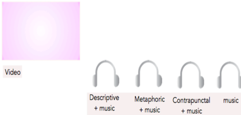
Figure 3 | Schematic of MediaScape system.

a transition, packed with the transition time from the current video clip to the next, and the commentary and duration of the video clip one more step into the future. Audio Metaphor receives this message, triggering the actions of crossfading into the next cued track, and generating the subsequent track to be cued.