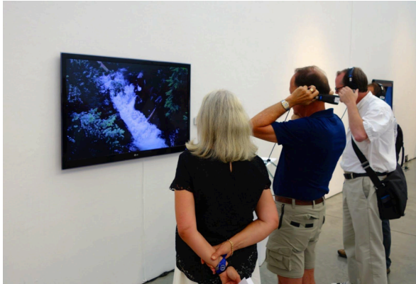
Figure 4 | MediaScape in installation with viewers listening to separate generative audio streams.

The work was exhibited as a single video channel with four separate audio channels, presented to the audience through four headphones (see Figure 3).