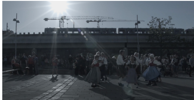
Figure 2: Screenshot of Folkofolk .

The composition of the scene with the train seemed well remembered by two participants, while a third observed “the people dancing in costumes under the train lines, the counter-existence of a cyclical to a linear pattern, of a cyclical pattern made of flesh and tradition to a linear pattern made of steel and modernity” (X16).