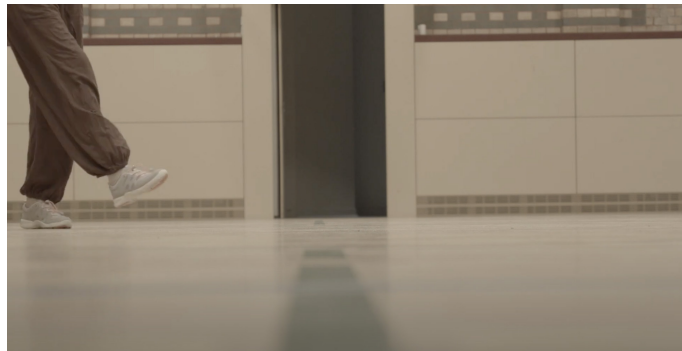
Figure 3: Screenshot of Folkofolk .

The opening scene which did not follow fragmented video/audio techniques was also remembered by X10 and X26, while X12 also reported the closing scene, along with the first one.