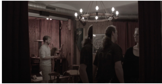
Figure 1: Screenshot of Folkofolk .

The composition of the scene with the train seemed well remembered by two participants, while a third observed “the people dancing in costumes under the train lines, the counter-existence of a cyclical to a linear pattern, of a cyclical pattern made of flesh and tradition to a linear pattern made of steel and modernity” (X16).