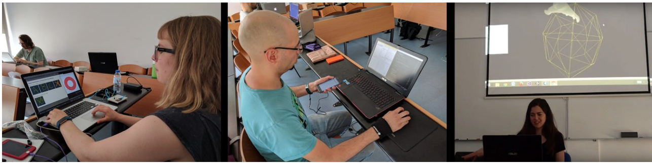
Figure 3 | a) and b) Participants working on their projects and c) presenting a final project.

piano. Technical and conceptual issues prevented the timely delivery of a fully functional hack.