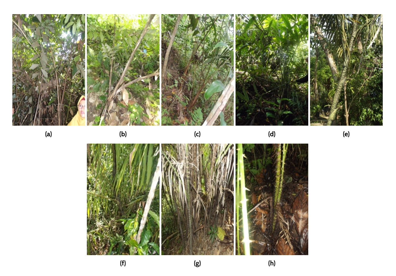
Figure 3. (a) Rattan Kayu in Bentayan Wildlife Reserve, (b) Rattan Kayu in Bukit Cogong Protected Forest, (c) Rattan Semambu in Bukit Cogong Protected Forest, (d) Rattan Semambu in Gunung Raya Wildlife Reserve, (e) Rattan Manau in Bukit Cogong Protected Forest, (f) Rattan Manau in Gunung Raya Wildlife Reserve, (g) Rattan Lelak in Bukit Cogong Protected Forest, (h) Rattan Lelak in Gunung Raya Wildlife Reserve.

surfaces of the leaves are brownish green and thorny.