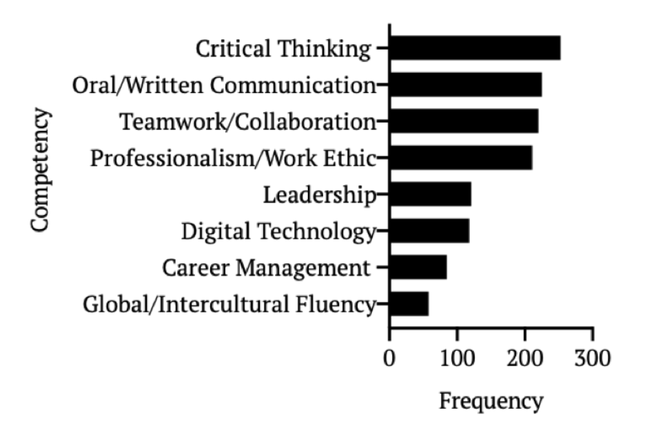
Figure 2. Frequency of Career-Readiness Competencies Taught in UREs

To assess the degree to which general, NACE competencies were already embedded in UREs, alumni were asked to select competencies taught in their UREs (RQ2, Figure 2). The top four competencies identified by participants correspond with four competencies that emerged in qualitative analysis. Critical thinking was most frequently selected (>70%) followed by oral/written communication, work ethic/professionalism, and teamwork/collaboration. These formed a group distinctly more frequent than the other career-readiness competencies.