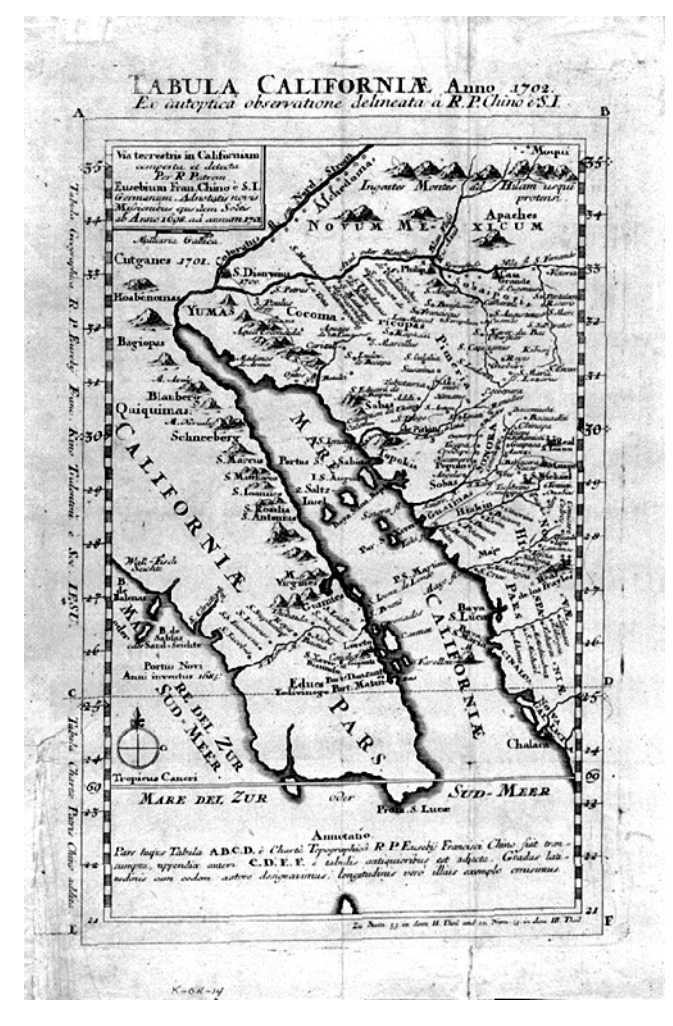
Father E.F. Chino (1702). "Tabula Californiae" (map). Place of printing unknown.

Note: the mission at Casa Grande and others to the south, a clear expression of Spanish incorporation and the transition of a region into the political-military network of interaction.