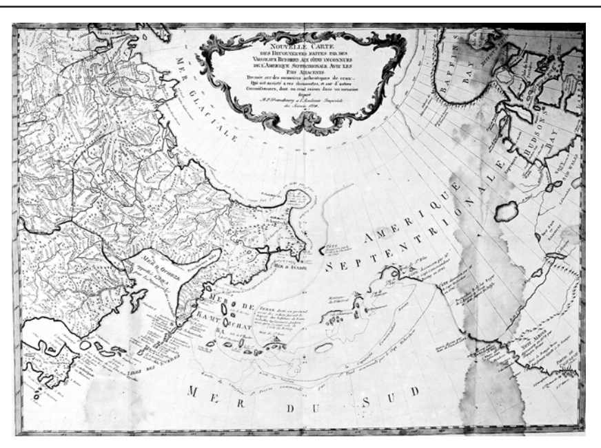
Russian Imperial Academy of Sciences (1758). "Nouvelle Carte des Decouvertes..." (New Map of Discoveries...). Originally published by the Russian Imperial Academy of Sciences, St. Petersburg. Electronic version courtesy of The Bancroft Library, University of California at Berkeley. <a href="http://library.berkeley.edu/EART/maps/">http://library.berkeley.edu/EART/maps/</a>

showing the extent of Russian discoveries in Alaska was acquired. (Plate 4)