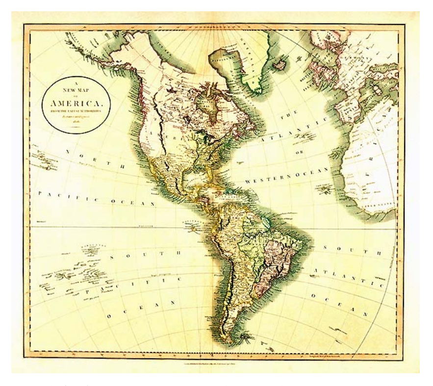
Plate 5 – A New Map of America from the Latest Authorities