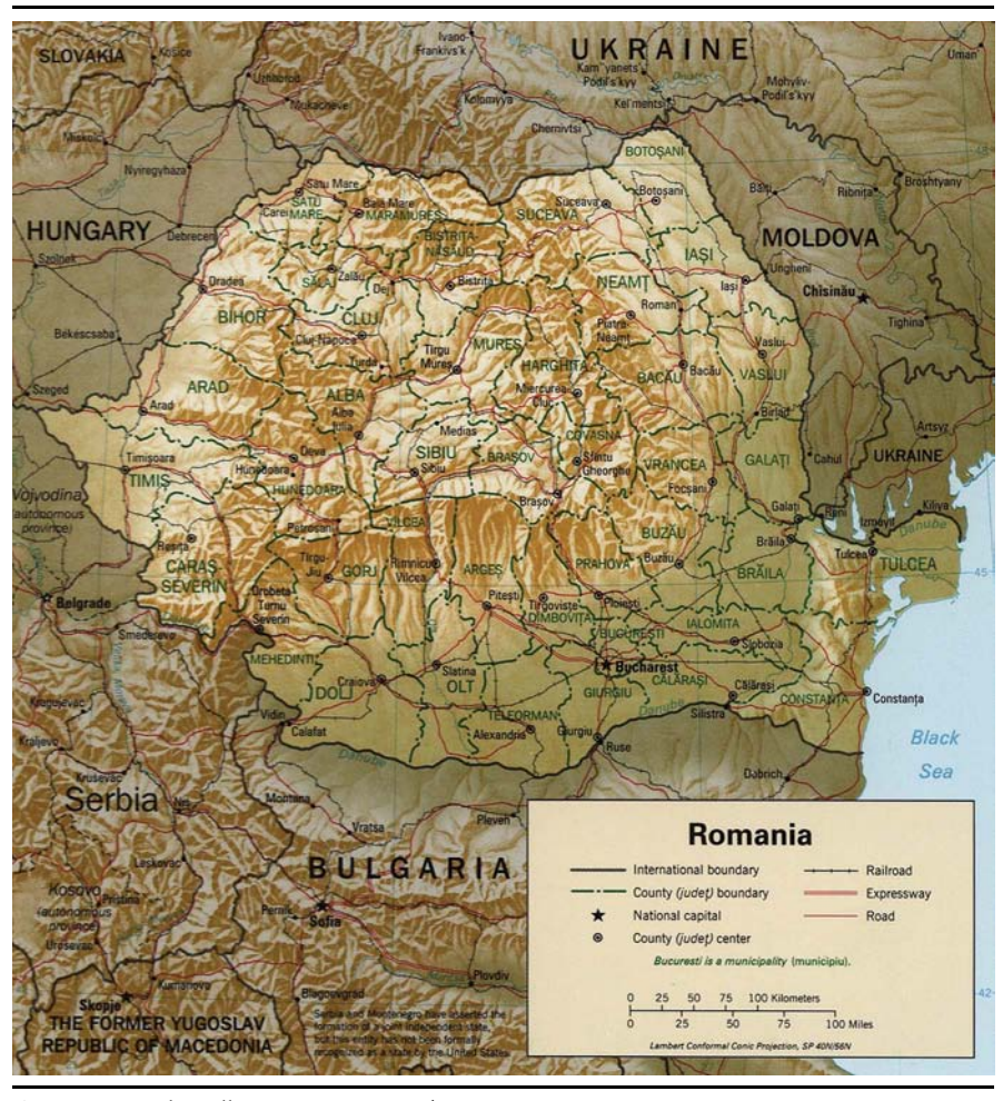
Plate 1 – Romania Today