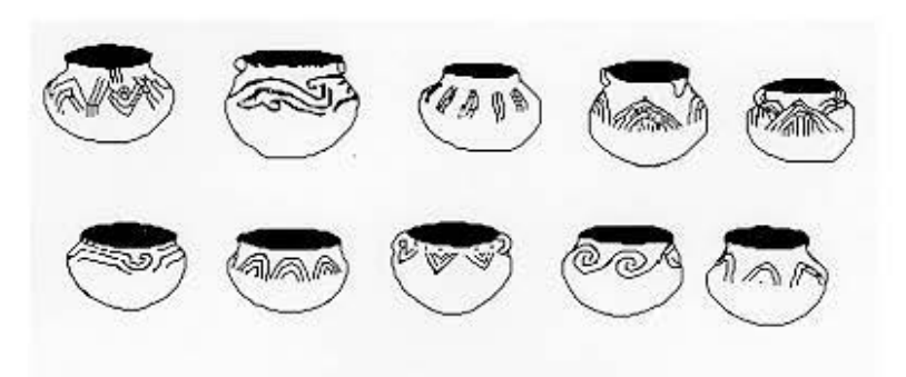
Figure 3. Top Row: Variants of Oneota Pottery Bottom Row: Variants of Ramey Incised Pottery

In addition, there is some evidence to suggest that the core/peripheral trade was asymmetrical in that some ritual items seem to be sent to the periphery, with little return to the core. John Kelley (1991) notes that when we examine the distribution of exotic artifacts in Cahokia and its northern periphery, we see that trade items made from materials to the south of Cahokia are found at Cahokia and its northern periphery. These artifacts include marine shells and hoes made from a particular, highly localized material called Mill Creek