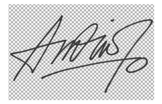
Fig. 2. Background elimination