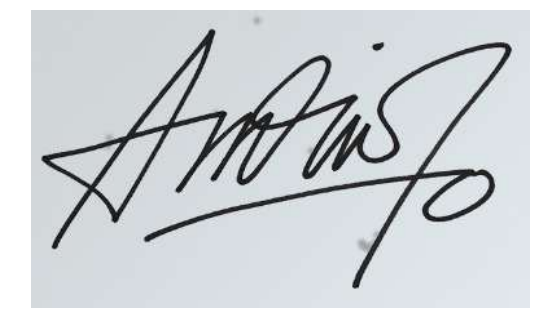
Fig. 1. Scanning process

Noise is dots on the image which are not a part of the image, but also in the image for a reason [10]. Noise is something undesirable, regarded as the cause of the lack of detail of the signature object. Therefore, noise reduction used to eliminate objects that are outside the signature area thus making the object or image detail becomes better. The result of the noise reduction process shown in Fig. 3. In image processing, normalization is a process that converts the pixel intensity range. Length and width dimensions of an object image are different. In this stage, the length and width of an object have to be recognized. In this stage, width normalization process was done by cutting the space between the edges of the image with the image object using Adobe Photoshop software. The outcome of this process is shown in Fig 4.