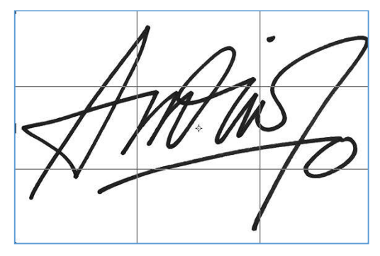
Fig. 5. Example of signature grid feature