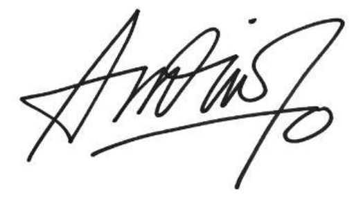
Fig. 4. The result of width normalization process

Fig. 5 is an example of a grid feature process result. In this discussion will look for the appropriate composition of the grid distribution. In general, the more the grid distribution, the greater the accuracy level, but requires memory and computation time that is greater. Therefore, it is needed to be done the grid testing of 3x3, 3x4 or 5x5. The experimental results are presented in Table 1.